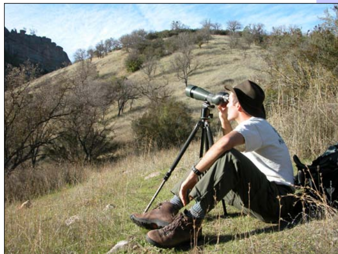
The objectives of the raptor monitoring program are to determine long-term trends of breeding raptors at Pinnacles National Monument and to establish advisory areas to protect nesting raptors.

As high trophic-level predators, raptor species serve as important indicators of ecological health at Pinnacles National Monument. As a result, long-term productivity data from raptor monitoring provides resource managers with a measure of park-wide ecological conditions, and provides a basis for continuing to implement advisories in high visitor use areas. Pinnacles National Monument has built a strong and supportive relationship with local climbing organizations, including Friends of Pinnacles and the Access Fund since the climbing advisories are based on specific occupancy and breeding data collected each season. Breeding records are also shared with the Santa Cruz Predatory Bird Research Group and the California Department of Fish and Game to put raptor monitoring at Pinnacles into the broader context of state and nationwide long-term vital signs monitoring efforts.