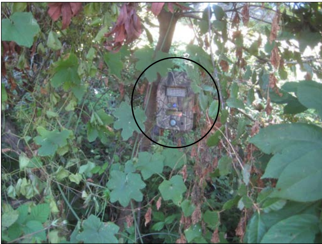
One of the wildlife cameras.