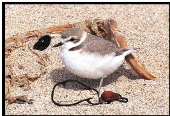
Female Adult Plover