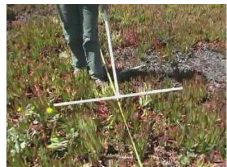
During the Myrtle's silverspot flight season of June through September, biologists walked vegetation transects. Along each transect, they measured the number and density of plants that the butterflies drink nectar from.