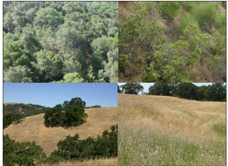
The 13 vegetation associations on Mt. Wanda represent four vegetation classes: (from upper left to lower right) forest, shrubland, woodland, and grassland.

Survey Method for vegetation communities: In 2004, the vegetation on Mt. Wanda was delineated using the California Native Plant Society rapid assessment protocol at 45 locations during the growing season. The data were used to classify vegetation to the alliance level of the NVCS. Recent color and black/white aerial photographs were used along with Geographic Information Systems (GIS) and GPS units in the field to determine the boundaries of each vegetation type. Due to the small size of Mt. Wanda, all polygons were checked in the field for accuracy of the vegetation type and