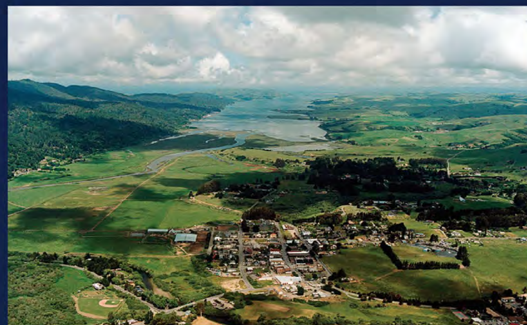
Looking northwest as the fault continues under Tomales Bay