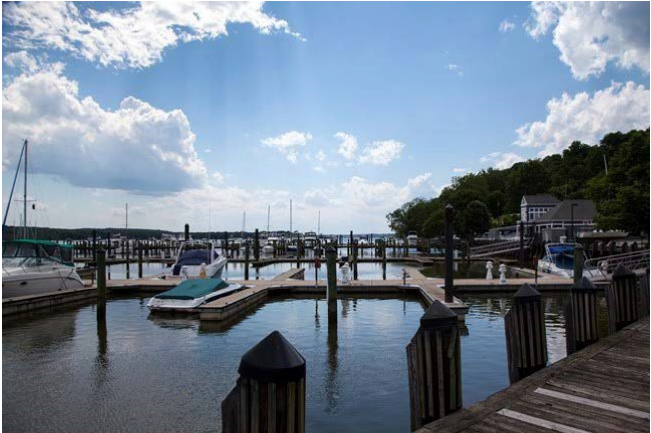
View of wet slips from Boardwalk