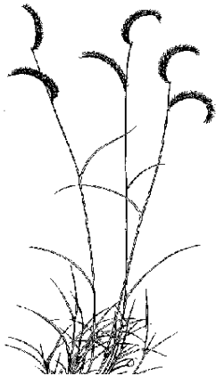
Blue grama grass