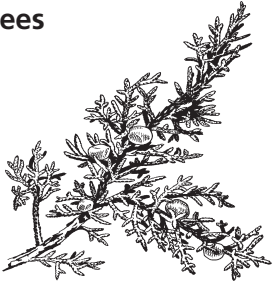
One seed juniper

Elaeagnus angustifolia * Russian olive Juniperus monosperma one seed juniper Juniperus osteosperma Utah juniper Pinus edulis twoneedle pinyon, pinyon pine Populus angustifolia narrowleaf cottonwood Populus deltoides ssp. wislizeni Fremont cottonwood Populus fremontii Fremont cottonwood