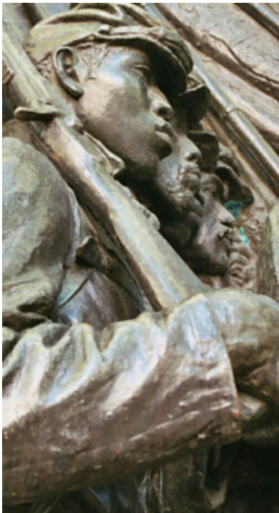
Augustus St. Gaudens memorial to the 54th Mass Infantry

munities, institutions, and national park units all across the United States to more capably tell their part of the Underground Railroad story. The NTF program currently has 355 members (sites, programs, and facilities) active in 30 states and the District of Columbia.