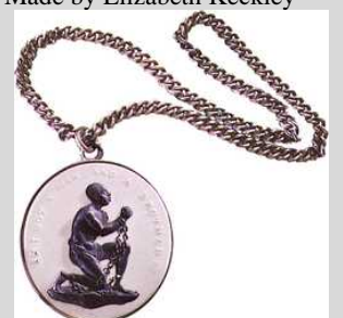
Antislavery Medallion, Wedgewood, 1787