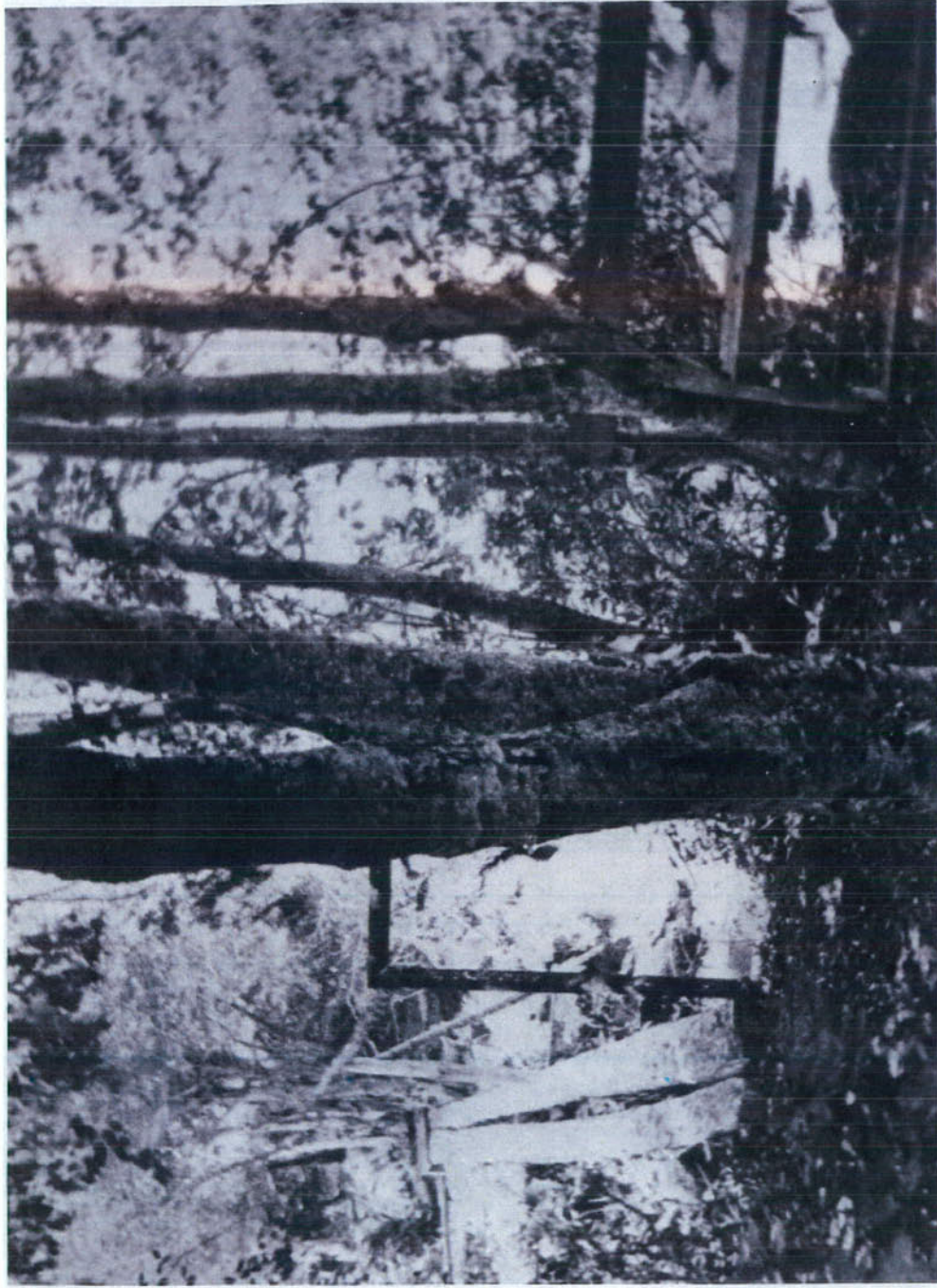
Figure 3. Footbridge over Big Creek (L) and bench nailed to alder trees (R), 1904.