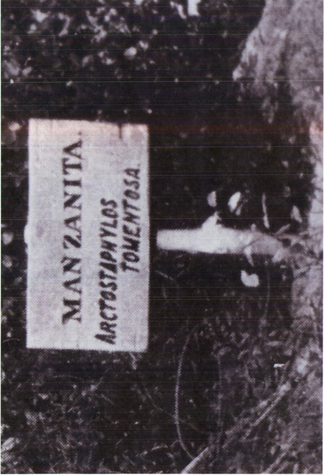
Figure 7. Example of arboretum sign, 1904