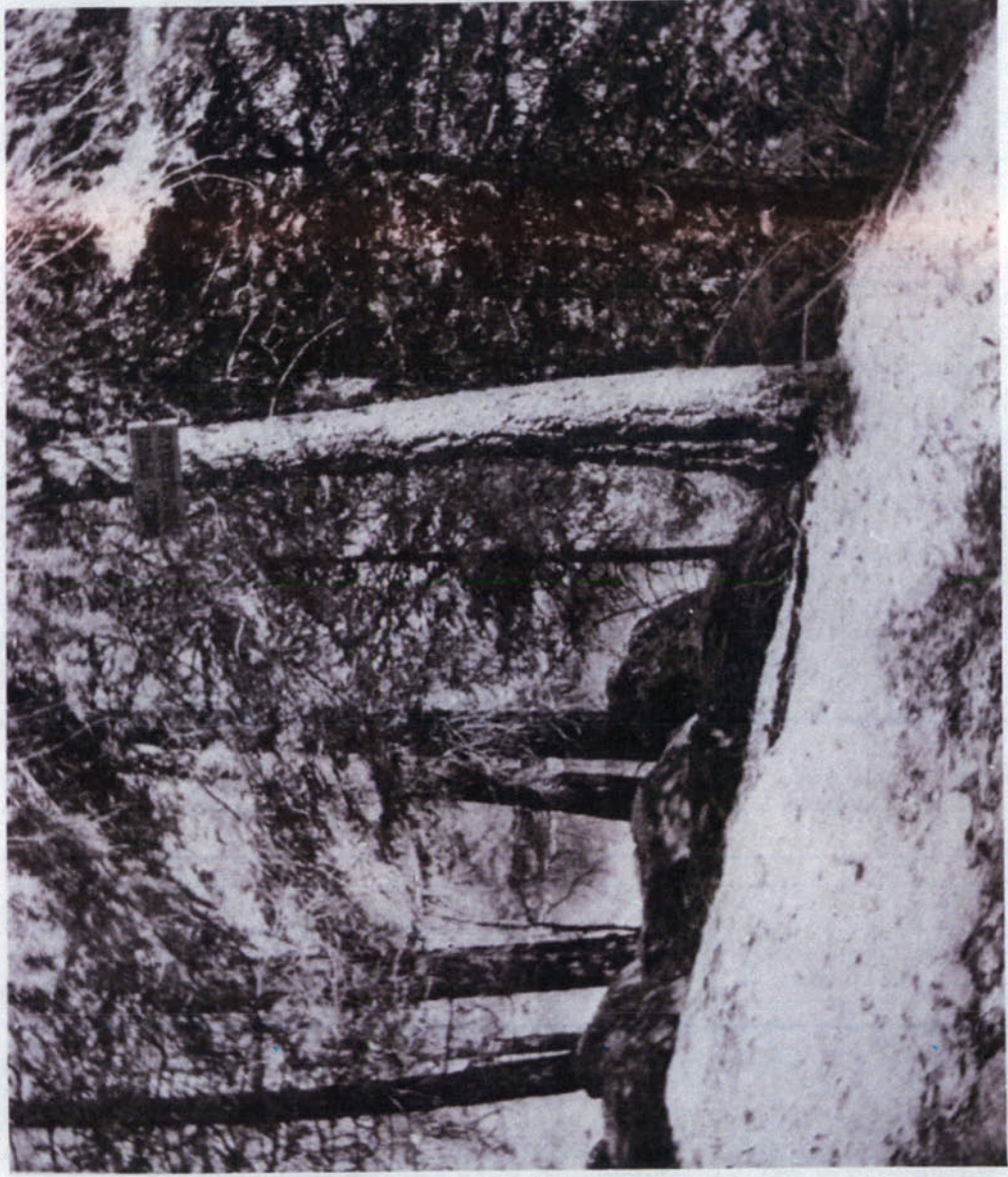
Figure 4. Douglas fir labeled "Douglas Spruce Pseudotsuga Douglasii ", 1904