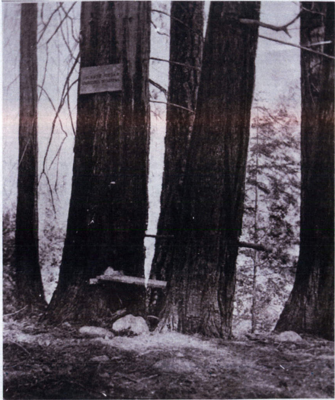
Figure 6. Incense Cedar bench group, 1904 (Yosemite Research Library)