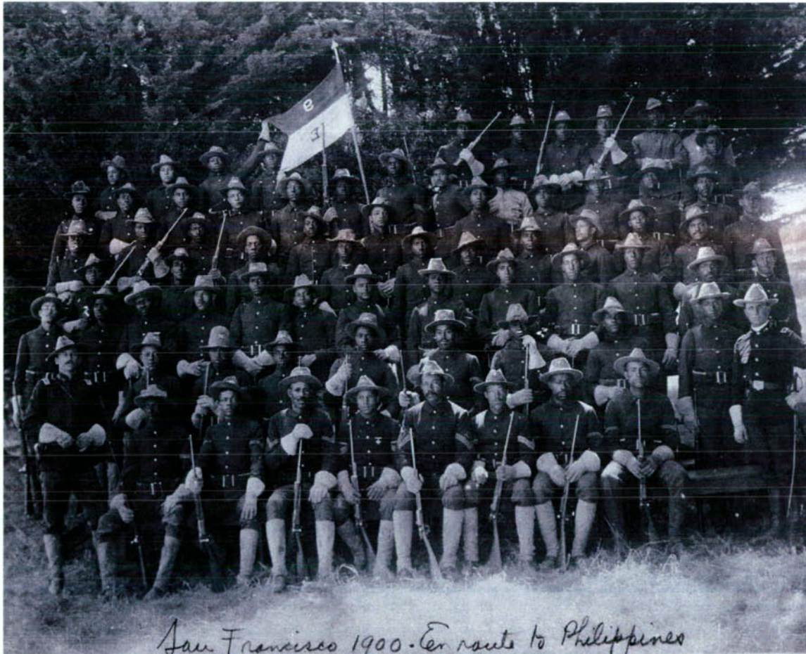
Troop E, 9 th Cavalry, 1900—Representative of the soldiers who would later patrol Yosemite National Park