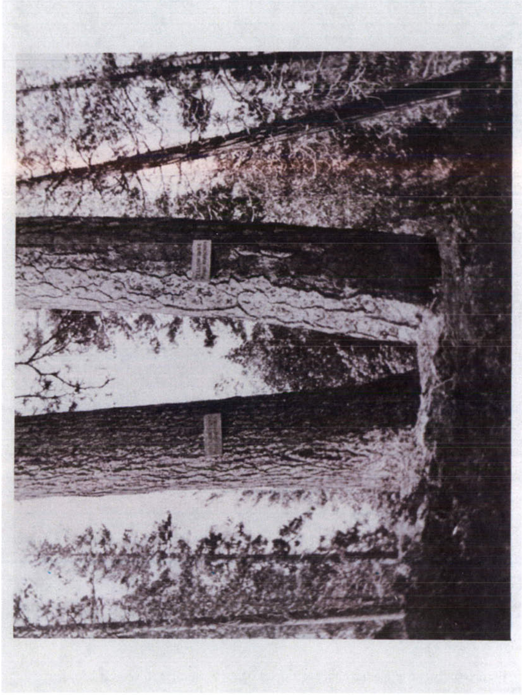
Figure 5. Sugar Pine and Ponderosa Pine, 1904