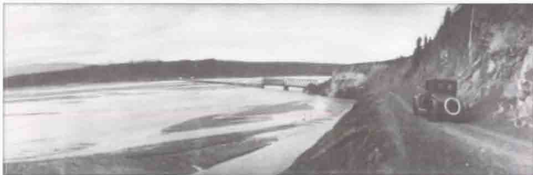
Nizina River Bridge.