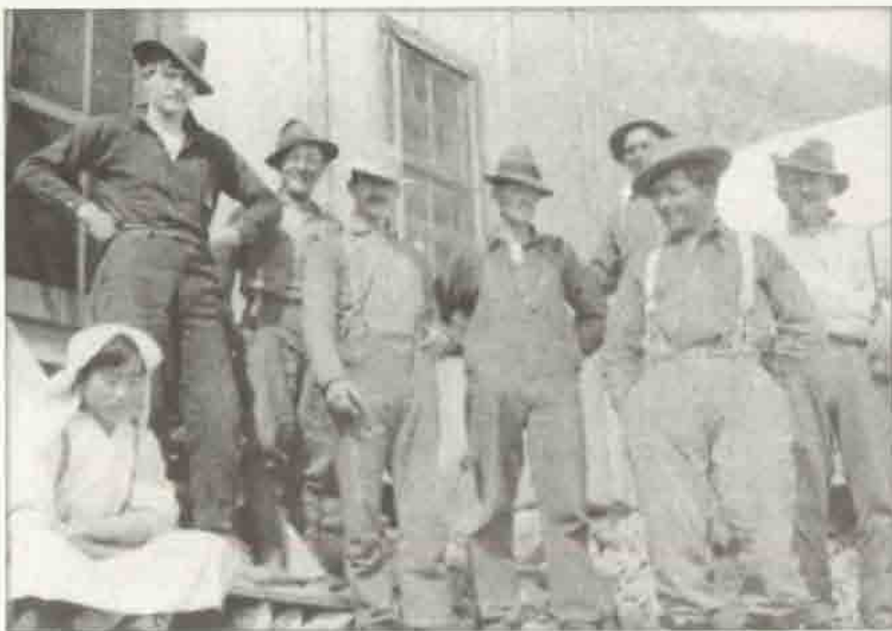
An Asian worker seated far left.