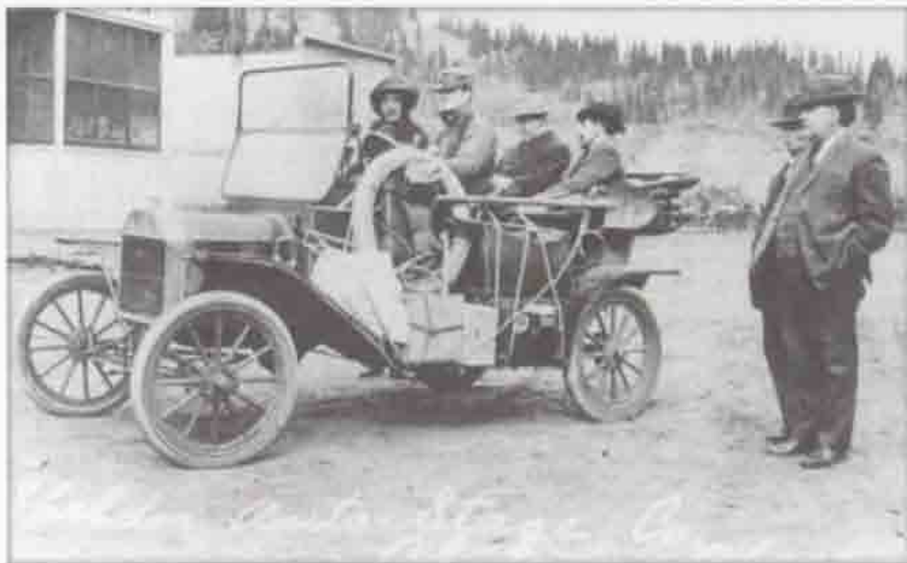
Horseless carriage, Sheldon Auto Stage Company.