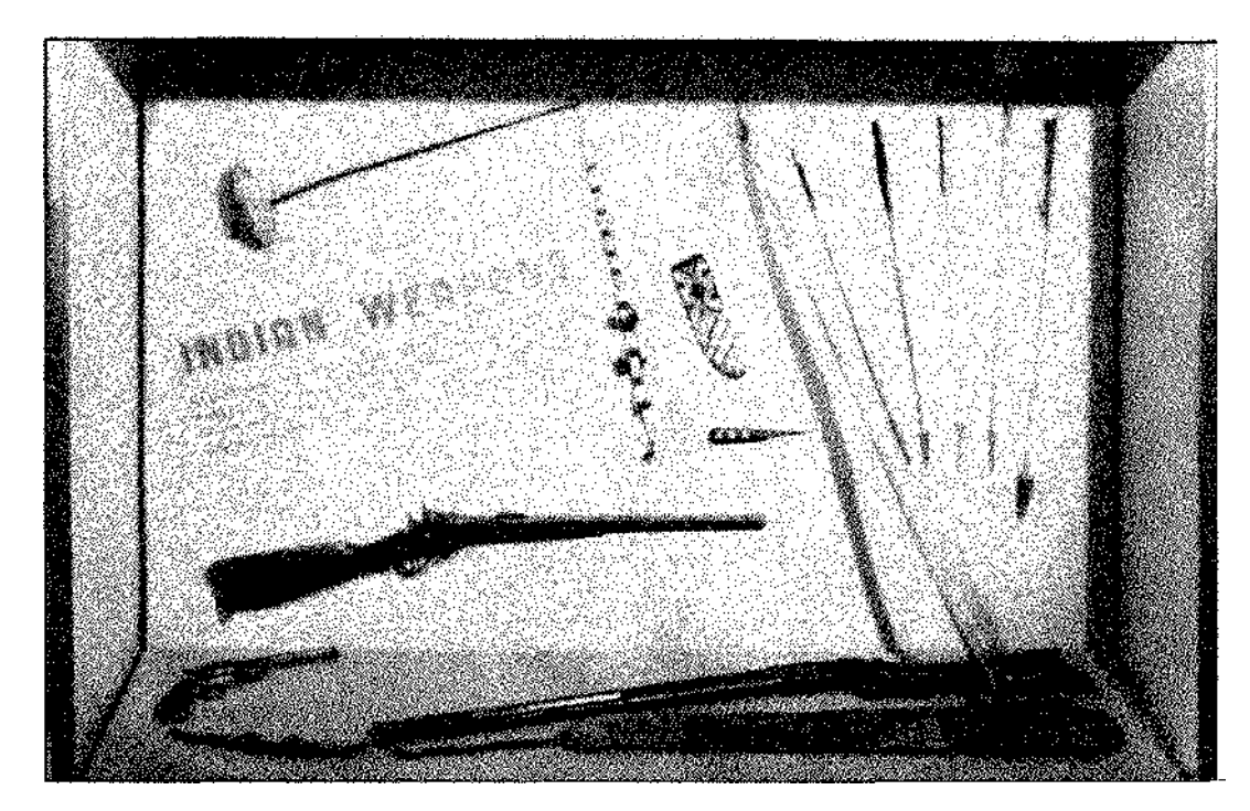
Custer Battlefield National Monument Museum, 1952. Exhibit typical of Museum Branch design and production after World War II.

should tell the story. After much thought it was agreed to begin the presentation with the shocking climax. Succeeding exhibits would then attempt to unravel the mystery of what had happened to leave Custer and every man under his immediate command dead on the field of battle. This decision gave crucial importance to the diorama of Custer's Last Stand. It should depict the scene not as previous artists had imagined it, but as accurately as close analysis of all available evidence would permit. As a master of the medium Burns himself modeled the figure of Custer. The result and the installation as a whole brought him deserved satisfaction when the museum opened on June 25, 1952.