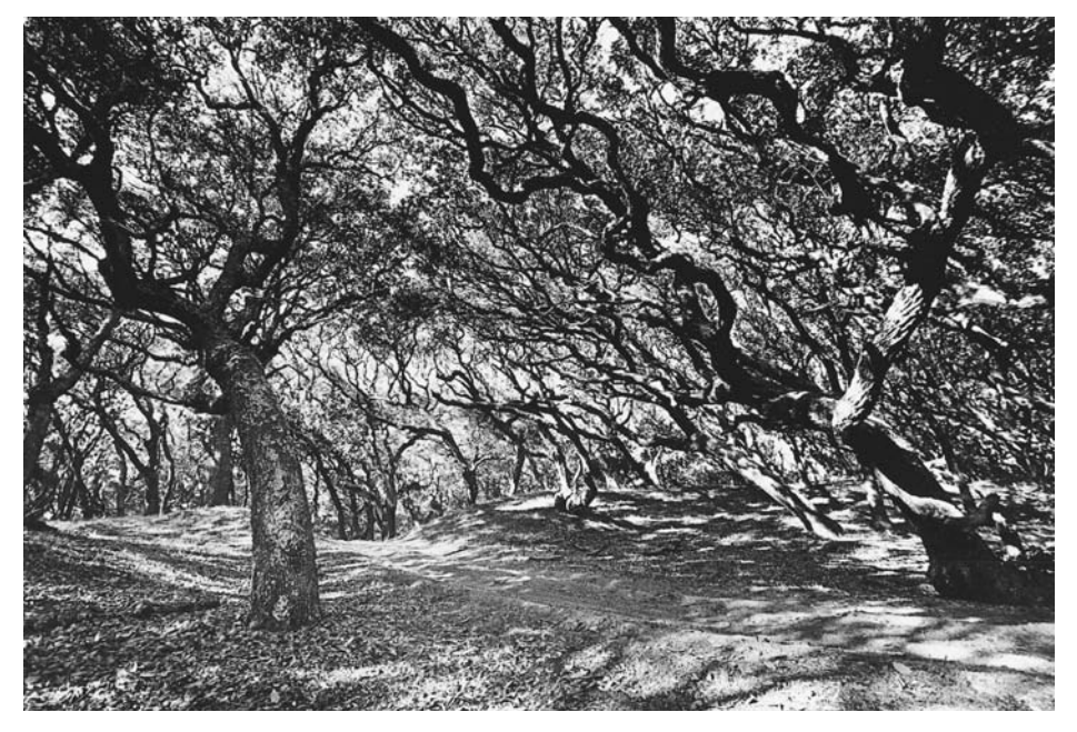
Fig. 1.1. One of the most important features of Cumberland Island is its extensive maritime oak forest.

historic preservation, wilderness advocacy, and recreation development organizations. Near the meeting's conclusion, the combatants gathered to sit in an old African-American church at the north end of the island. The participants had come several miles by either the main road under the towering forest or by boat through twisting lanes in the marsh, according to their conservation beliefs. All sat in the few pews of the tiny church as a silence descended. Finally, someone acknowledged that he understood the passionate beliefs of the other side even though he could not agree. The opposition offered a similar view. The talk turned to the values that they shared. Every person in that abandoned church loved Cumberland Island and sought the absolute best for it. Their understandings of best would continue to clash, but for a moment they saw themselves as a united group, united by passion for a special place. That passion for this paradise makes Cumberland Island National Seashore an unfortunate arena for conflict. It is also what makes it one of the most rewarding of the nearly 390 national park units.