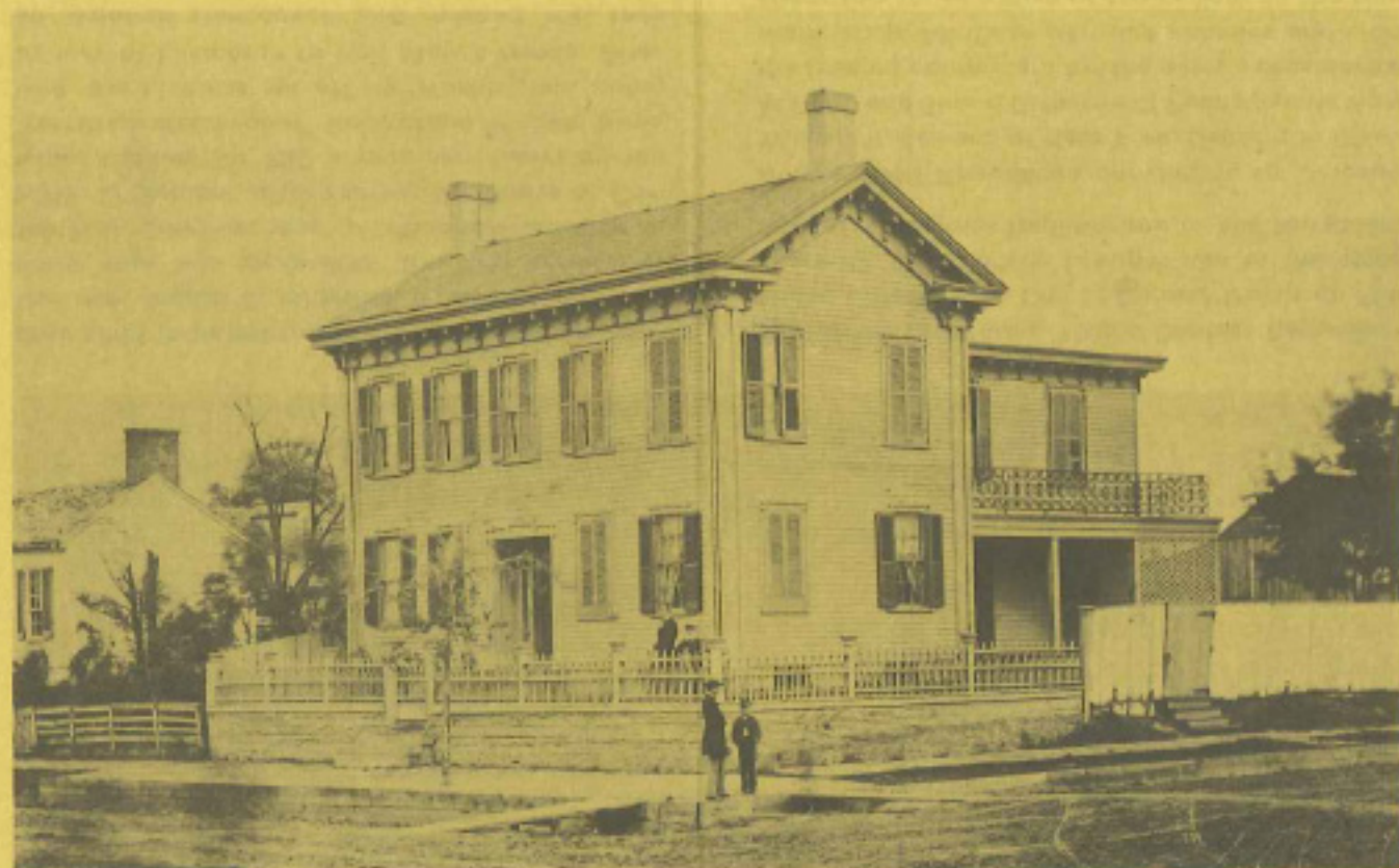
Lincoln in the 1858 election for the U.S. Senate and whom, among others, Lincoln defeated for the Presidency in 1860. And here he met Mary Todd, his wife-to-be.

For Lincoln, the young lawyer and up-and-coming State legislator, Springfield possessed opportunities which could only enhance his already promising future. Here Lincoln could meet politicians and local leaders from all over the State. One was Stephen A. Douglas, a State senator, who defeated