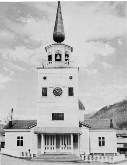
St. Michael's Cathedral.

The Russians then brought their guns closer and settled down for a siege. After several days the Indians ran out of ammunition and, believing their cause to be hopeless, fled in the night and made their way to the northeast side of the island. As a result of this battle, the way was left open for the development of Sitka, which became the center of Russian activities in the New World.