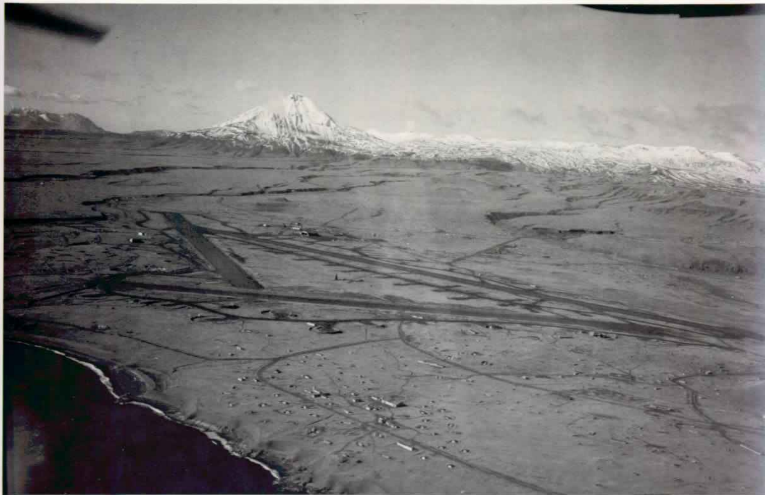
From the air, Cape Field runways provided unmistakable landing sites for World War II pilots. Circular revetments and fueling stations channeled air traffic on and off the busy runways. This photo, taken in 1960, shows the Birchwood hanger north of the runways and the density of surrounding construction. On the land between the creek beds hundreds of artillery bunkers stand empty. Snow-covered Mount Tulik in the background erupted in 1944.