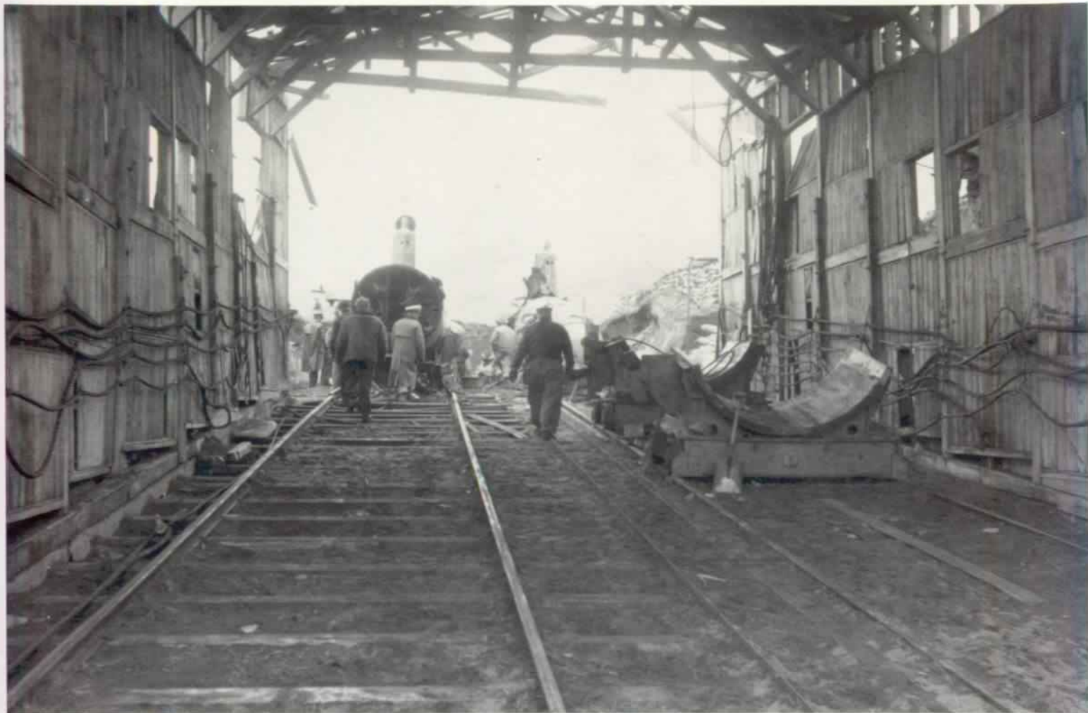
In the background of this photo, taken in September 1943, are two Japanese midget "Sydney" type submarines, found by reoccupation troops outside of a battered submarine shed on Kiska. The one-man subs measured just under 80' long and were powered by storage batteries.