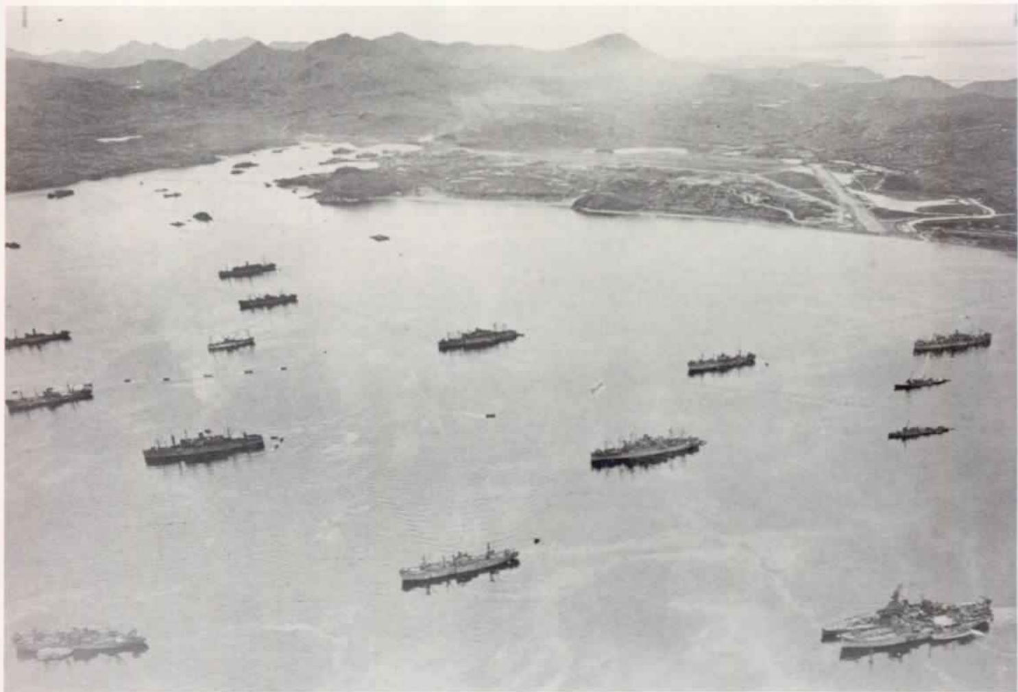
An American fleet gathered in Kuluk Bay, off Adak, in preparation for the Kiska invasion on August 15, 1943. In the background are the two runways composing Adak's original airfield, Davis Field.