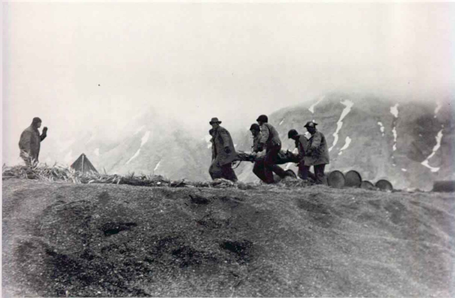
On May 14, 1943, American soldiers carry a casualty back to the beach. Attu was reclaimed at the cost of 549 American lives and 1,148 wounded. The Japanese lost their entire garrison of approximately 2,350 men, with the exception of twenty-nine men taken prisoners.