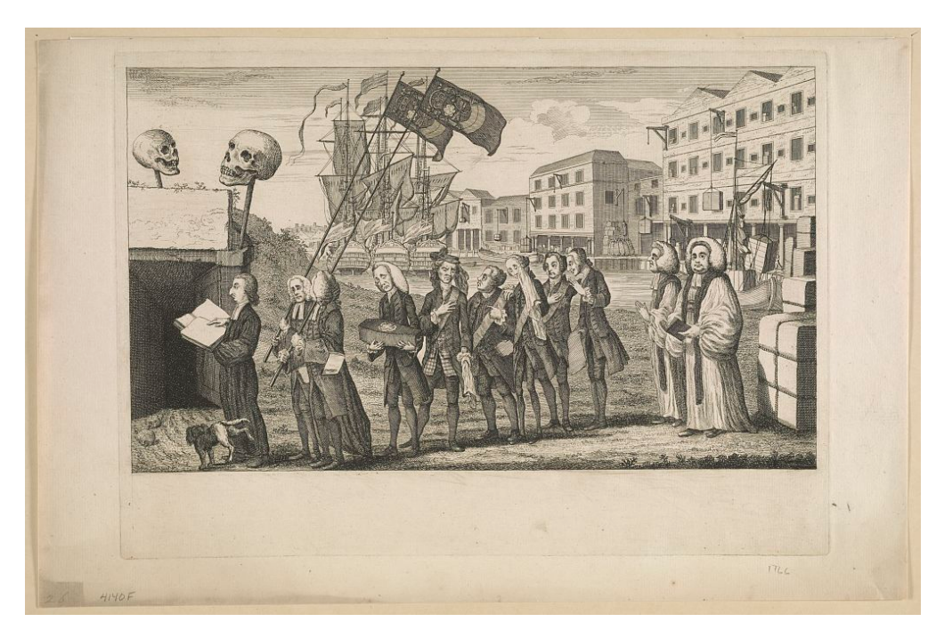
While Bostonians rejoiced in the "funeral" of the Stamp Act, depicted in this 1766 engraving, the methods of protest they used against Parliament in the first half of the eighteenth century would serve as precursors to the Tea Party.

When Parliament imposed duties through the Stamp Act in 1765, the Townshend Acts in 1767, and the Tea Act in 1773, Boston already had economic issues that limited the real wage of its workers, especially the mariners who required stability in the maritime economic market to survive. Thus, its tax burden became more difficult to bear than that of Philadelphia or New York, which did not experience hardships of the same caliber. Coupled with an uneven distribution of wealth that made rich merchants richer and poor laborers poorer, Boston became the most "politically volatile" of the northern seaports. The average Bostonian had a history throughout the eighteenth century of determined resistance "to those with great economic leverage who used it in disregard of the traditional restraints on entrepreneurial activity" (i.e. the earlier Puritan notion that merchants and wealthy landowners should not become rich at the expense of the poor). This sprang to life again to protest the Stamp and Townshend Acts.<sup>vi</sup>