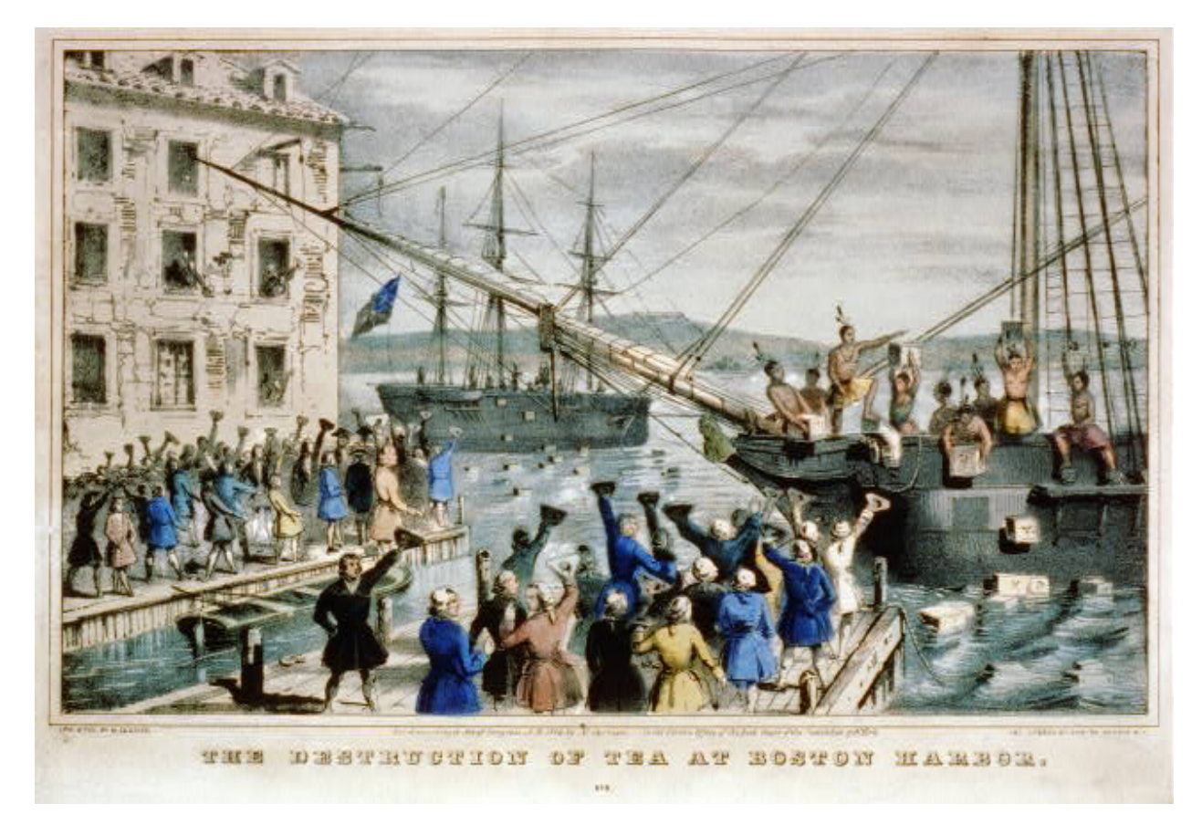
This famous 1846 Currier & Ives print of the Boston Tea Party illuminates the lasting impact that the demonstration had on the memory of the American Revolution.

Almost two-thirds of these men were artisans, and the rest were retailers, petty traders, mariners, farmers, or laborers – those whose "grievances were linked to the town's economic troubles" and who understood that their futures depended on recognizing the power of place in a center of maritime trade to shape political, economic, and social status.<sup>x</sup> In the end, a century's worth of economic and social struggle with authority in a place that derived its livelihood from the intrinsic relationship between maritime trade and mercantilism had created a sense of individual power that brought the everyday man to the forefront of fight against British policy.