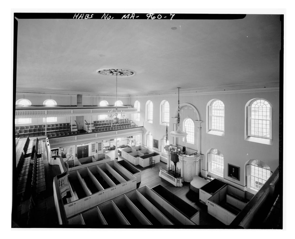
The pews and gallery seating shown here in the interior of Old South Meeting House held over 5000 Bostonians during the deliberations on December 16, 1773.