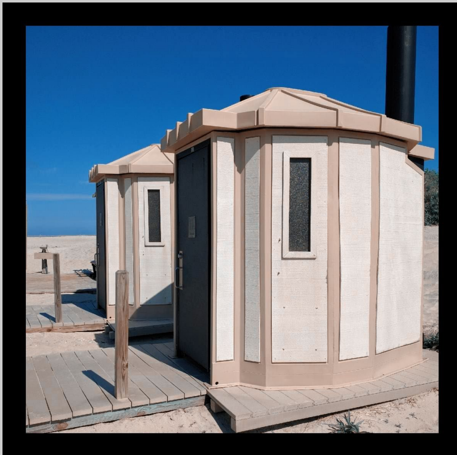
Assateague Island National Seashore uses moveable facilities to provide visitor services in light of anticipated climate impacts.

The Association of Climate Change Officers will present two sessions to build capacity for climate change preparedness across NPS facilities management divisions through two online training programs: