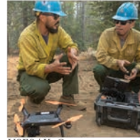
USFS / K. Greer