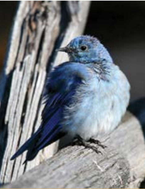
MOUNTAIN BLUEBIRD AT MORMON ROW, GRAND TETON NATIONAL PARK.

SOUTHEAST REGION LAND RESOURCES PROGRAM CENTER - NAPLES 2975 Horseshoe Drive South, Suite 800 Naples, FL 34104