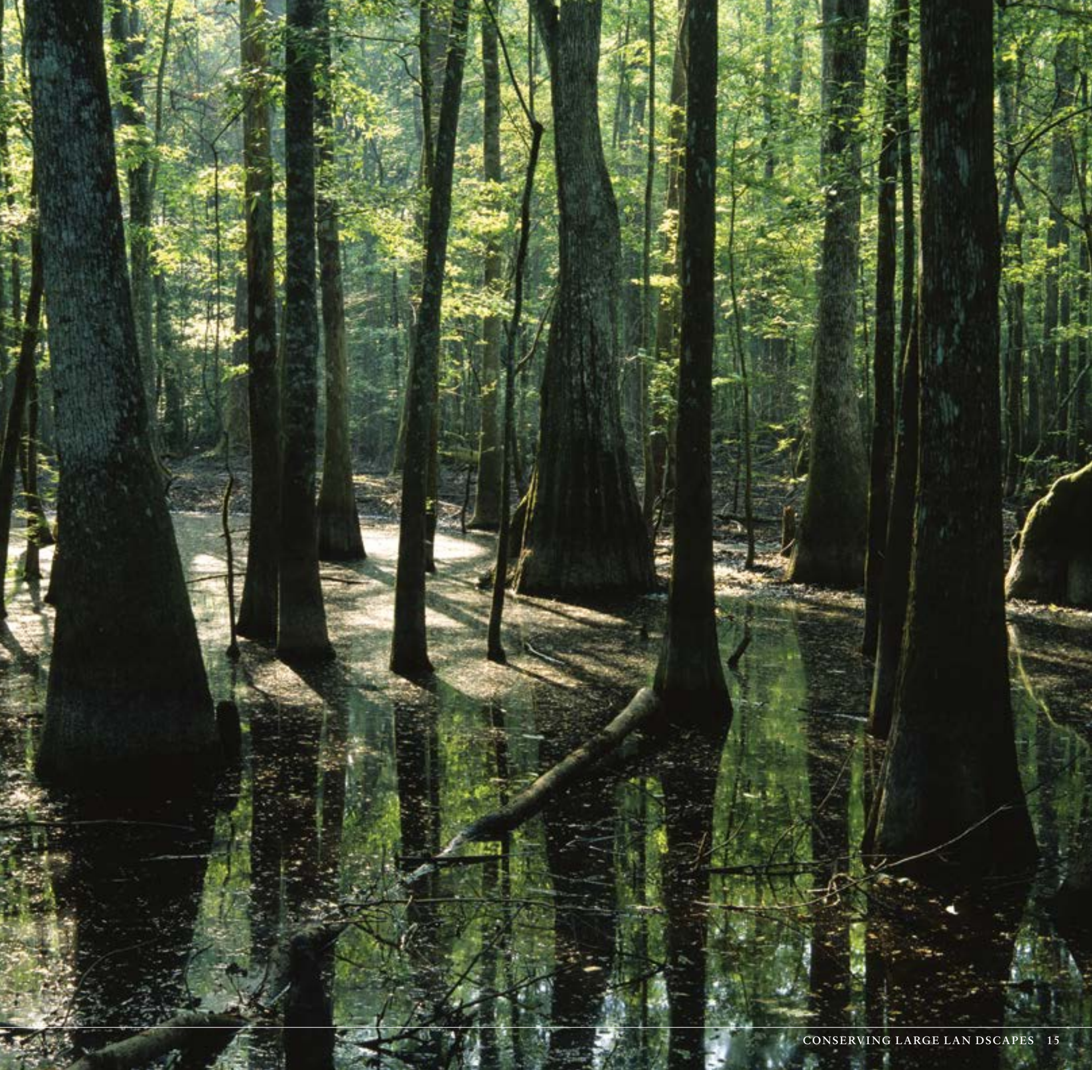
TREES CROWD THE CYPRESS-TUPELO SWAMP IN BIG THICKET NATIONAL PRESERVE.

The Conservation Fund (TCF) has been partnering with the NPS on land protection activities to preserve more than 42,600 acres since 2004. In 2009, TCF made the largest donation in Big Thicket National Preserve’s history, donating 6,600 acres of bottomland hardwood forest and cypress-tupelo swamp to the NPS. In 2010, TCF helped the NPS purchase more than 4,000 acres of former Hancock Timber land. These purchases added more than 800 acres to the Canyonlands unit of the preserve and more than 3,600 acres along Village Creek. The Village Creek acquisition also contributes to large landscape conservation goals by establishing a continuous conservation corridor with Village Creek State Park; providing habitat for migratory waterfowl and songbirds; and serving as a floodplain that will protect the communities along Village Creek and the Neches River.