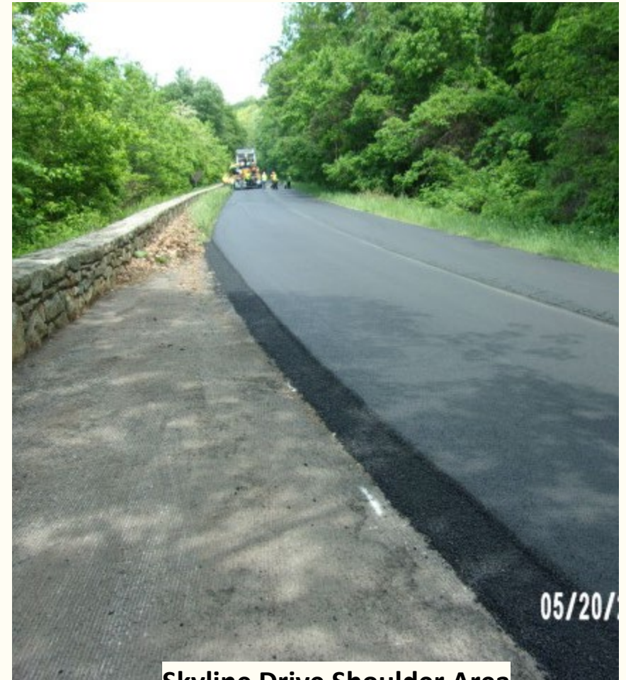
Skyline Drive Shoulder Area