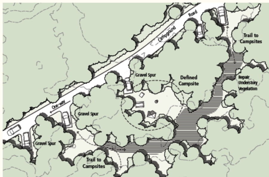
Figure 1: Restoration and delineation of existing camp sites