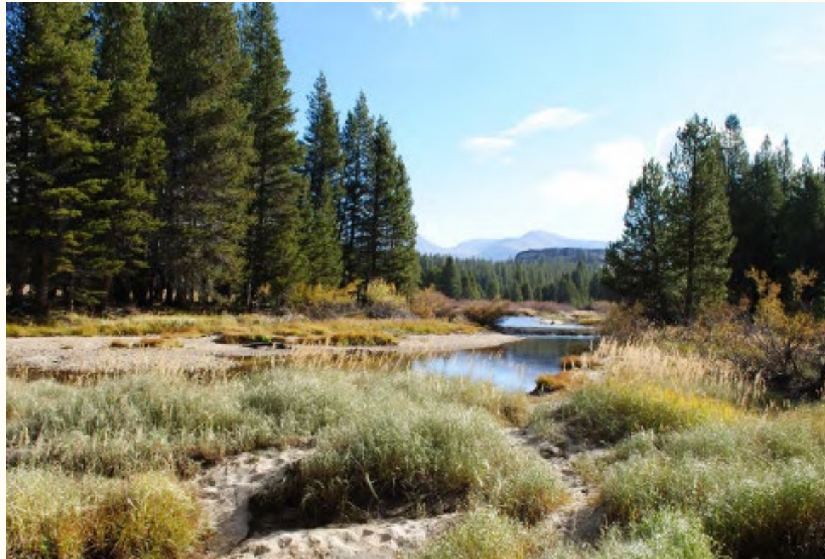
Figure 7: Tuolumne Meadows Area