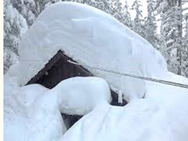
Figure 5: Winter conditions