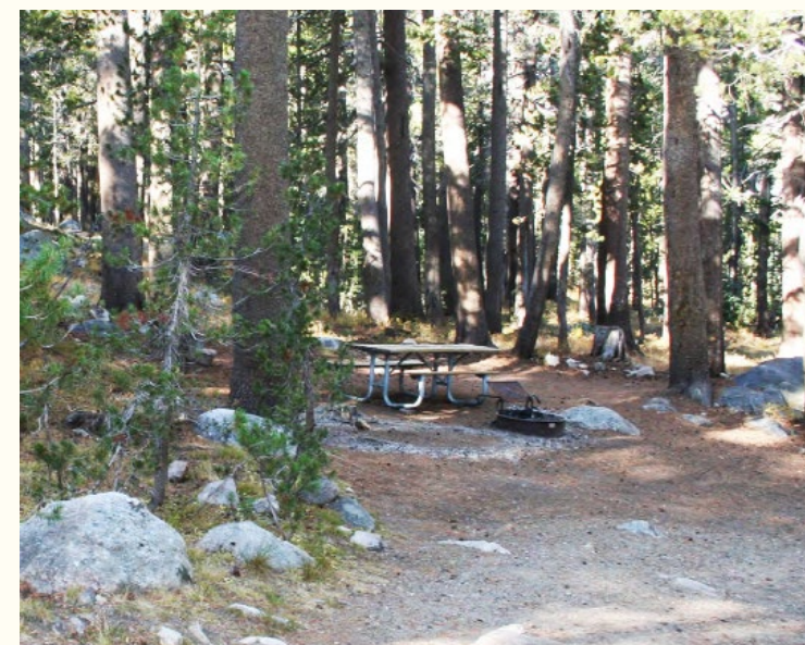
Figure 2: Example of existing campsite