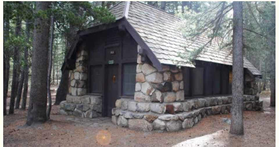
Figure 6: Existing historic restroom