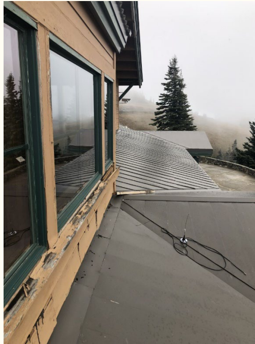
Window damage from water intrusion