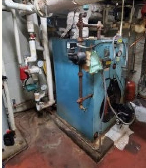
Failing boiler systems