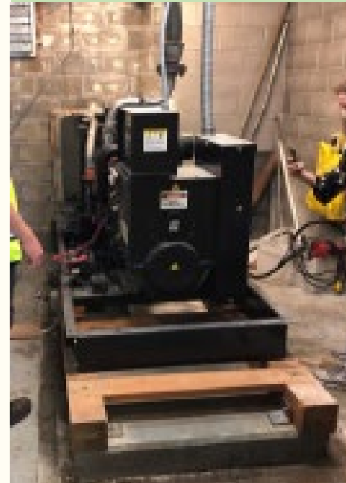
Fuel tank replacement