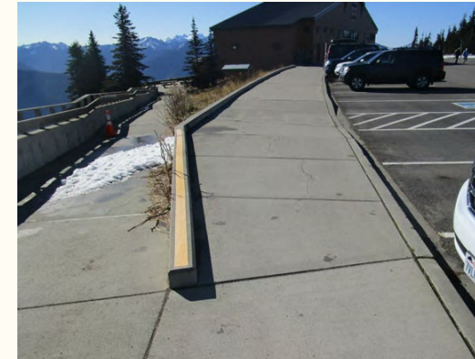
Non-compliant access routes