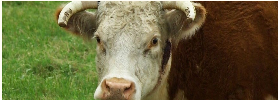
Still a working Ranch