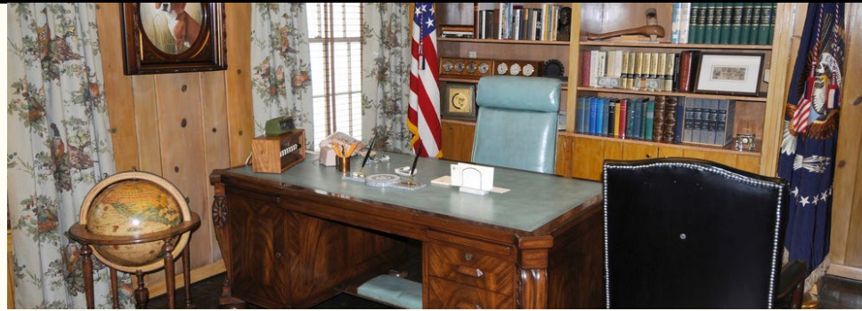
LBJ's Desk in TWH