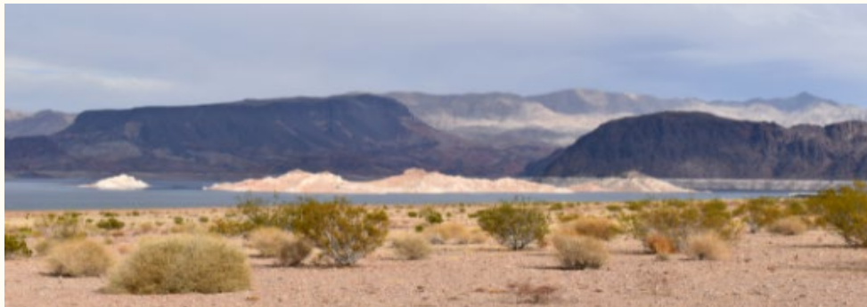
Restore natural environment