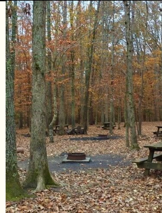
Turkey Run Campground