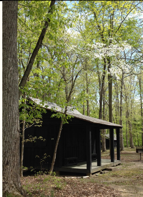
Camp Cabin 3 Campground

Existing concrete septic field weir diversion and distribution box located at Camp Cabin 3. Outflow pipes are clogged full of roots