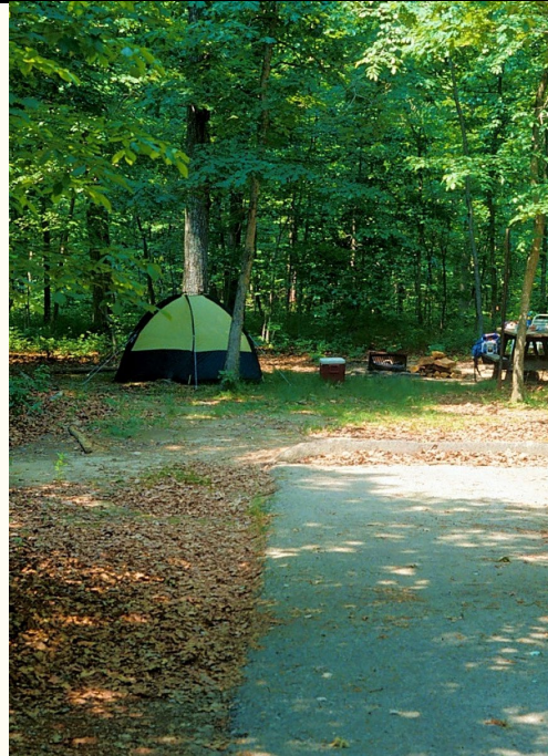
Oak Ridge Campground

Existing brick manhole with vitrified clay pipes located at the Cabin Camp 3