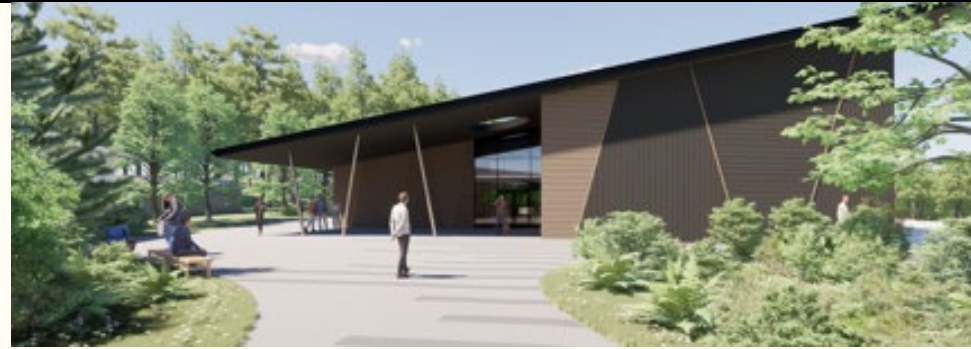
View of main entry