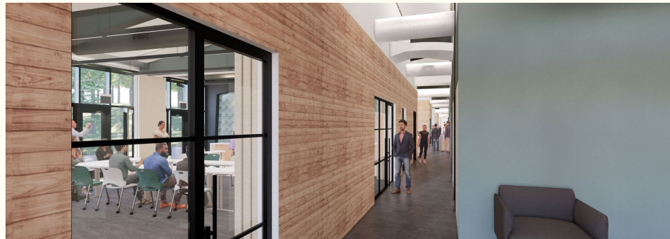
View from entry vestibule