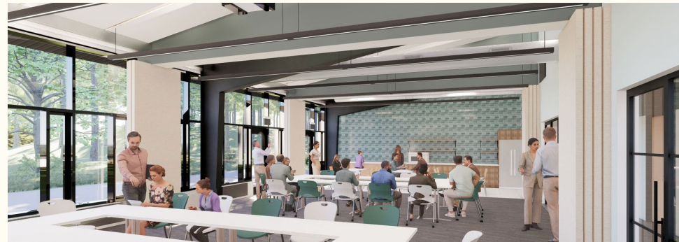
View of conference room