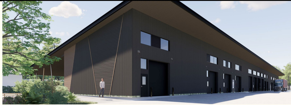
View of shop bays