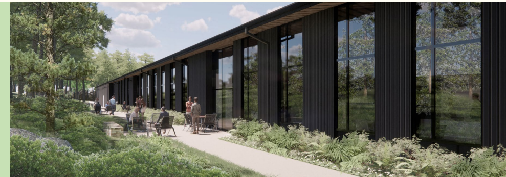
View of office space from the exterior