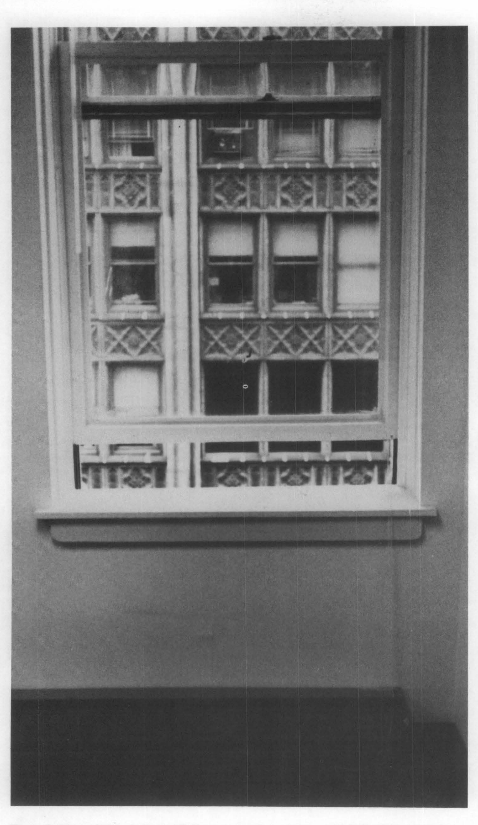
Figure 3. View of the window with the lower sash partially raised following completion of the work. Due to the large size of the sash, the small flat aluminum trim piece covering the spacer had little noticeable effect on the appearance of the windows as viewed from the typical office area.

The primary seal for the insulating unit was then created by applying an electrical charge for about 5 to 10 minutes through the two copper wires. The wire-resistant heating melted the butyl compound on both sides of the spacer since the aluminum spacer easily conducted the heat generated by the wires to the polyisobutylene strip on the opposite face. As a secondary seal to retard moisture collection between the glass and help secure the new glass in the sash, a silicone compound was applied in the space between the wood frame, the old glass and the edge of the new glass and the metal spacer (see figure 2).