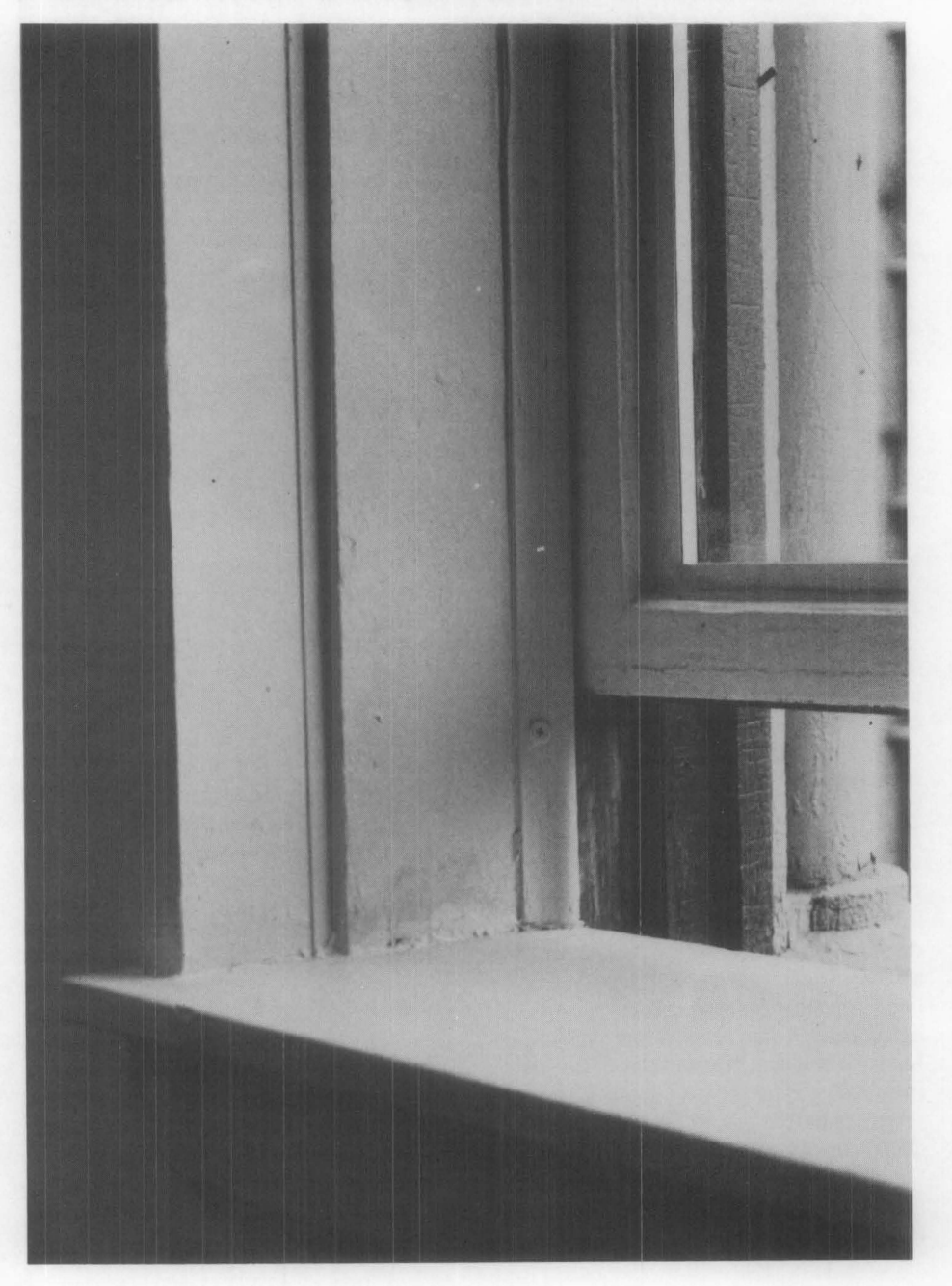
Figure 1. Since the metal spacer placed between the glass sheets is set slightly off the edges of the rails and stiles, the retrofitted insulating unit reduces the historic glass exposure by about 1/2" along all sides. This change on large windows is hardly noticeable particularly once the flat trim piece is glued in place.

Modification of the window sash was accomplished off site. Each window was tagged, working one floor at a time, prior to shipment to a shop facility nearby. Once in the shop, necessary sash repairs were made, loose paint scraped off, and the glass on the inside surface carefully cleaned.