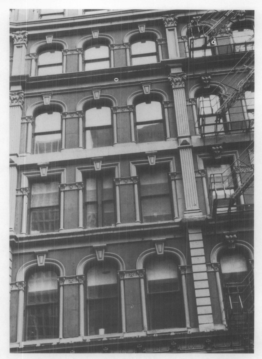
Figure 4. View of the windows on floors 3 thru 6 shows that the technique used for creating sealed insulating glass units in the existing wooden sash had no noticeable impact on the historic appearance of the windows as seen from the street below.

Attractive cost savings over all new sealed units can be realized with this retrofit system, particularly when dealing with arched top sash or windows that vary in size. There are though certain obvious limitations. Where the interior moldings around the inside edges of the rails and stiles are decorative, the manner in which the additional sheet of glass is installed would obscure such detailing. With multipane sash with typical muntin sizes, the encroachment onto