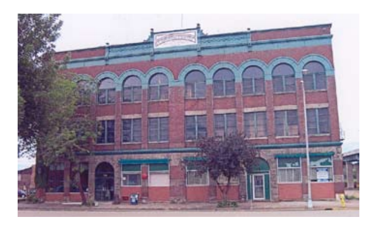
Above: The warehouse storefronts had been changed prior to rehabilitation.

Compatible new storefronts were installed as part of the rehabilitation. Each of the storefront windows was replaced with a correctly-proportioned lower panel with a display window and a two-light transom above. Simply-designed double doors with a two-part transom were installed in the two entrances. This treatment meets the Standards.