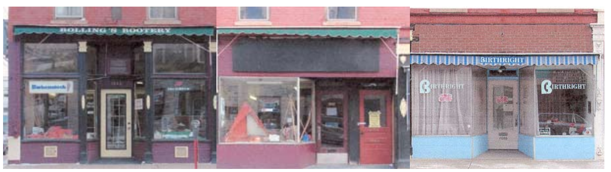
Details of existing storefronts prior to rehabilitation.

The rehabilitation of these buildings for retail/commercial use on the first floors and residential use on the upper floors included installing compatible new storefronts. As part of the rehabilitation the original cast iron pilasters were retained and repaired. The new replacement storefronts are painted wood and consist of a lower panel and large glass display windows. The new doors are simple in design and feature transoms above. Although the original storefront windows could have included transoms, the new full height, undivided showcase windows without transoms are compatible with the historic character of these buildings. Accordingly, this rehabilitation project meets the Standards.