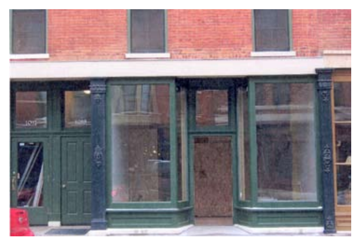
The buildings with compatible new storefronts after rehabilitation with detail of new storefronts.

Application 2 (Compatible treatment): This 1912 hardware warehouse was rehabilitated for low-income housing. Over the years, the first floor storefront openings had been altered. A single door, surrounded by green spandrel glass sidelights and transom, filled in the entrance. Brick infill had reduced the size of the window openings, especially those on the right side of the façade. The historic storefront windows themselves had been replaced with smaller unpainted aluminum windows with green spandrel glass transoms.