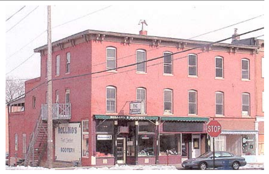
The three buildings prior to rehabilitation.

Application 1 ( Compatible treatment ): These three buildings constructed in 1868 are part of a three-story commercial block. The storefronts had been remodeled prior to rehabilitation, each