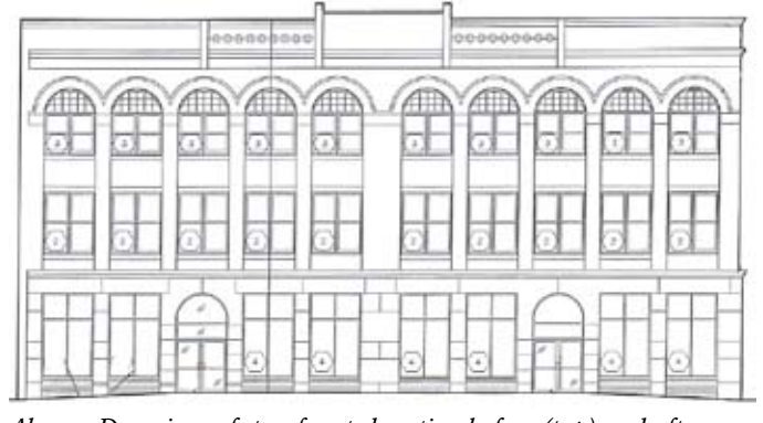
Above: Drawings of storefront elevation before (top) and after (center) rehabilitation. Below: The warehouse with compatible new storefronts after rehabilitation.