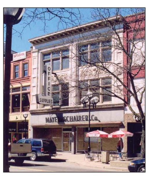
Three-story commercial building prior to rehabilitation.

almost halfway from the front façade and, thus, it minimally is visible from public the street and within from district. the High party walls on either side also help