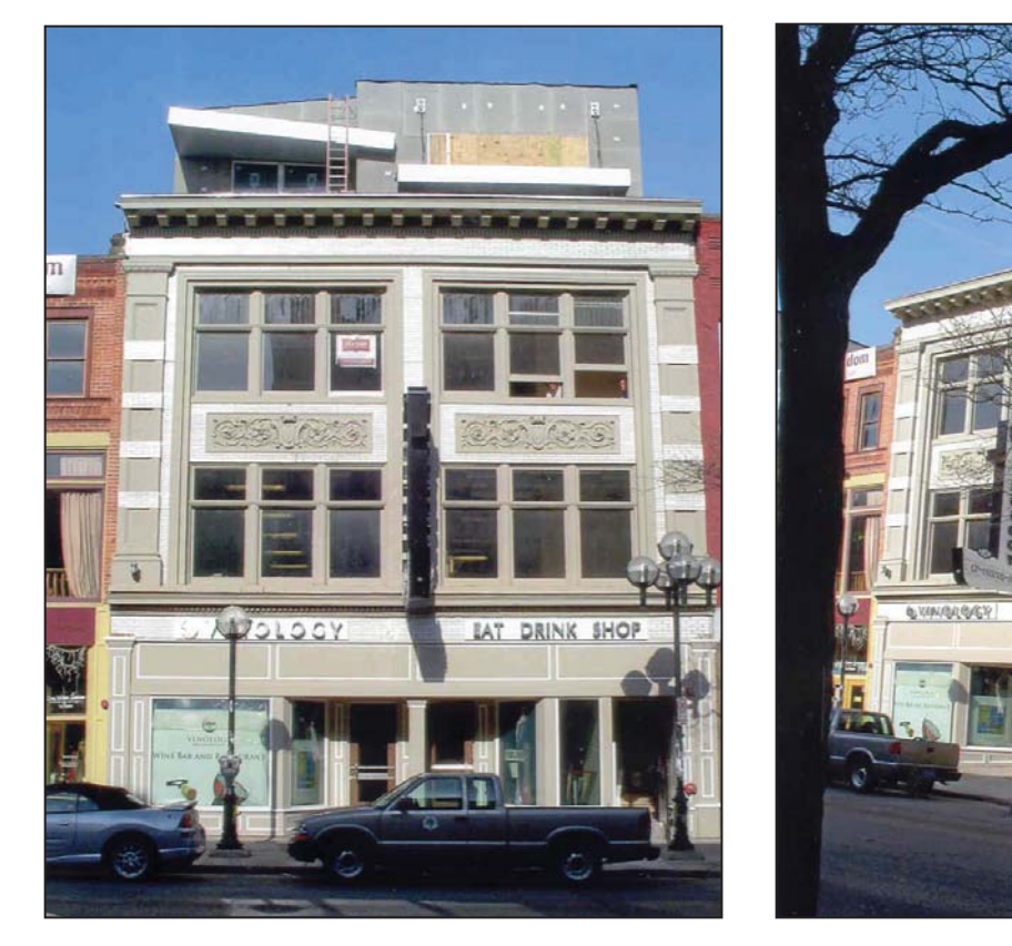
Three -story commercial building showing rooftop addition under construction.

Liz Creveling, Technical Preservation Services, National Park Service