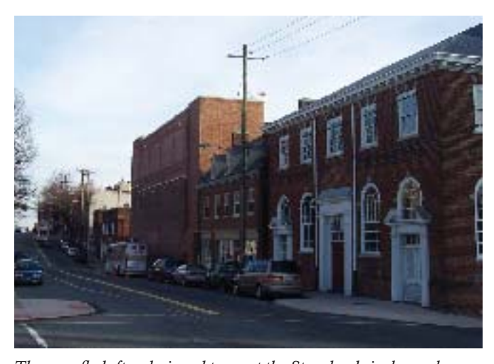
The new fly loft redesigned to meet the Standards is shown here after rehabilitation.