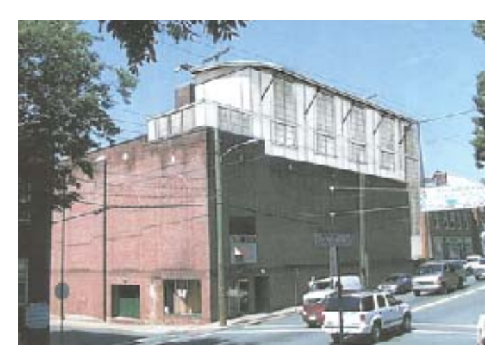
Original proposal for fly loft at the rear of the building was incompatible with the character of the historic theater.

Application 2 ( Incompatible treatment revised to meet the Standards): This Colonial Revival-style theater was built as a movie house in 1930 and, because it originally showed only movies, never had a fly loft. Vacant for over thirty years, the community planned to reuse the theater for a variety of performances. Because the rear of the theater where the stage is located is quite visible, the fly loft design needed to minimize the impact of the added space. The first proposal was a contemporary design of glass and aluminum with a prominent curved roof. This design competed with the architectural style of the building and did not meet the Standards. The fly loft was redesigned using slightly varied brick with a simple decorative pattern to break down its massing. While the fly loft is sizeable, it is sensitively executed and compatible with both the historic theater and the surrounding historic district.