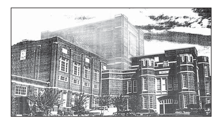
Initial proposal for fly loft.