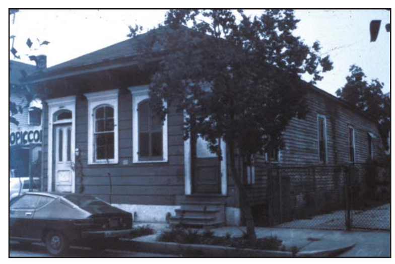
Circa 1890 shotgun cottage prior to rehabilitation.

Application 2 ( Incompatible treatment ): In the second example, radical changes made during the rehabilitation obliterated the characteristic shotgun plan. The wall between Room #1 and Room #2 in both units was removed to create one large room in each unit. Almost the entire rear half of the unit on the right side was incorporated into Unit A on the left side. This effectively destroyed most of the wall separating the two units that defined the shotgun plan. In addition, greatly truncating the length of Unit B further impacted the plan by eliminating the progression of rooms so typical of shotgun interiors. To make up for the space lost from Unit B on the right side a staircase was added to access two bedrooms that were created in the attic. Converting Unit B from a one-story unit into a two-story unit further altered the historic character of the house. The units no longer convey a sense of the original shotgun plan as a result of these changes. Accordingly, the project fails to meet the Standards for Rehabilitation.