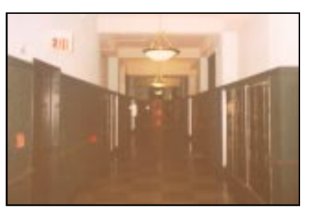
Character-defining features were retained in the corridors and former classrooms.