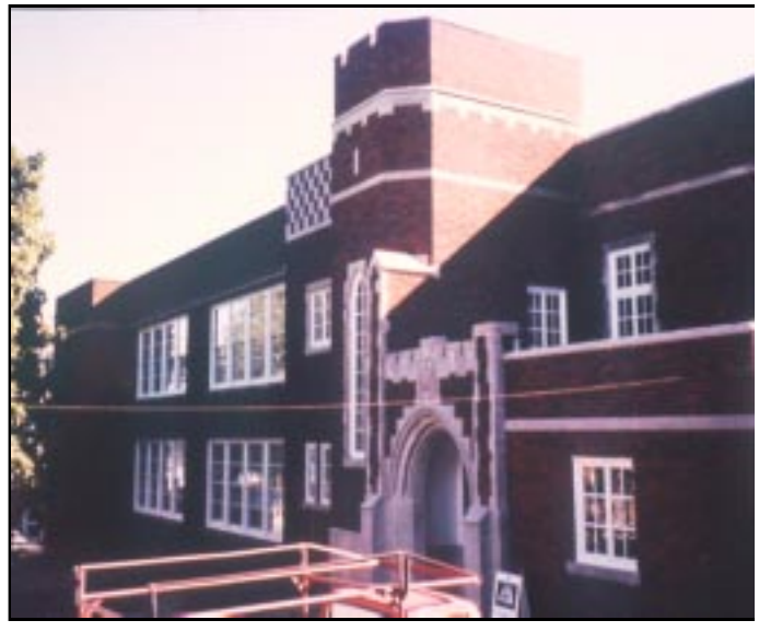
This 1925 high school annex was rehabilitated as residential/work units.