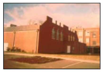
This 1930 school was rehabilitated for use as elderly housing.

Application 3 (Compatible treatment, retention of character of gymnasium): When another, early-twentieth century school building was rehabilitated for use as senior housing, primary character-defining features were preserved in the classrooms. Part of its gymnasium was also adapted for apartments. Two rows of apartments were created on two sides of the gymnasium leaving the center section with its full height and exposed truss system clearly visible as an atrium-like, open space. Like the previous example, by converting only a portion of the gymnasium to apartments, enough of the gymnasium was retained intact so that its essential character and spatial volume were still apparent.