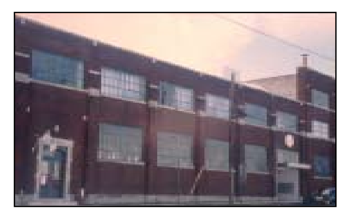
This small manufacturing building had brick walls in the industrial spaces, but several offices on the first floor had finished plaster walls.

Application 2 ( Incompatible treatment, exposed lath ): Even historic industrial and warehouse buildings may sometimes contain finished interior spaces. Although the upper floors and most of the first floor of this 1927 factory were rough, unfinished spaces typical of this type of structure, a portion of the first floor which was used for an office always had plastered walls. The building was recently rehabilitated for residential apartments upstairs with several retail spaces on the first floor. One of the tenants in a first floor retail space left a jagged portion of lath exposed when repairing the plaster walls, apparently, as a decorative accent. This treatment was determined not to meet the Standards. Replastering the exposed lath re-established the finished plaster wall which characterized this historic office space, and allowed the rehabilitation project to be certified.