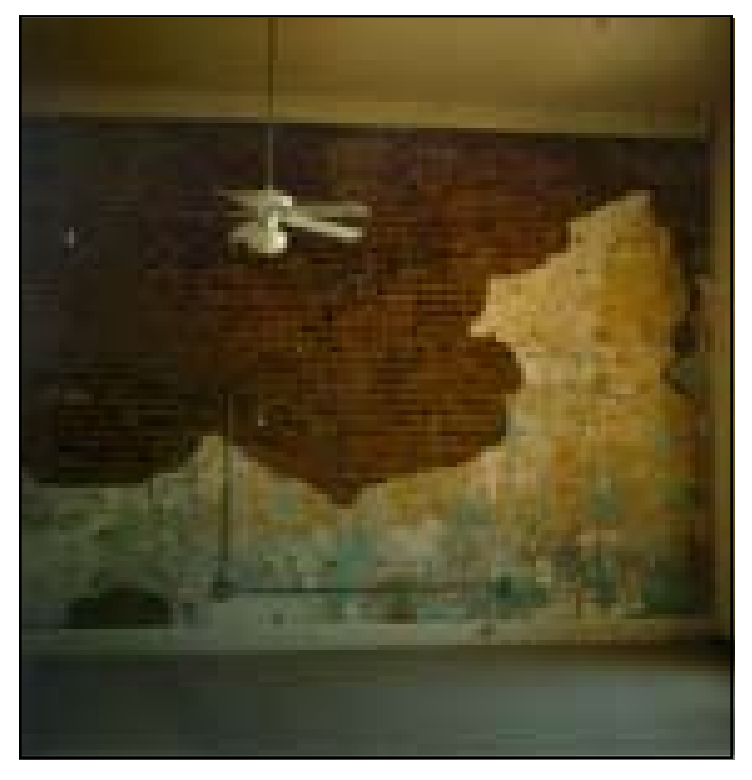
Keeping deteriorated plaster fragments as found without repairing the plaster finish is not an appropriate rehabilitation treatment for most historic building interiors.

Issue: Finished plaster walls and ceilings are important in defining the character of many historic buildings. But deteriorated plaster surfaces are not character-defining and they are not representative of the historical appearance of a building. Just as removing plaster to reveal brick which was never exposed historically does not meet the Standards, leaving a historic plaster wall in a deteriorated condition also does not meet the Standards. Deteriorated plaster should always be repaired, or replaced with gypsum board, in a rehabilitation project.