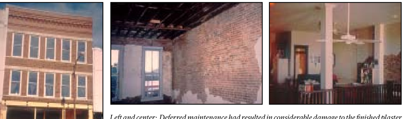
Left and center: Deferred maintenance had resulted in considerable damage to the finished plaster on the upper floors of this small commercial building.

Application I ( Incompatible treatment, exposed brick ): Built c. 1900, this small, three-story, brick structure was rehabilitated for retail use on the first floor, with residential use above. Historically, the walls were finished plaster. However, after years of deferred maintenance, when rehabilitation work began much of the plaster was in a very deteriorated condition and only patches of it remained on the walls. As part of the rehabilitation, the owner kept what remained of the plaster in its as found condition in the apartments on the upper floors. This treatment was determined to be incompatible with the historic character of the building. In order for the project to meet the Standards the owner was required to repair the plaster or replace it with gypsum board.