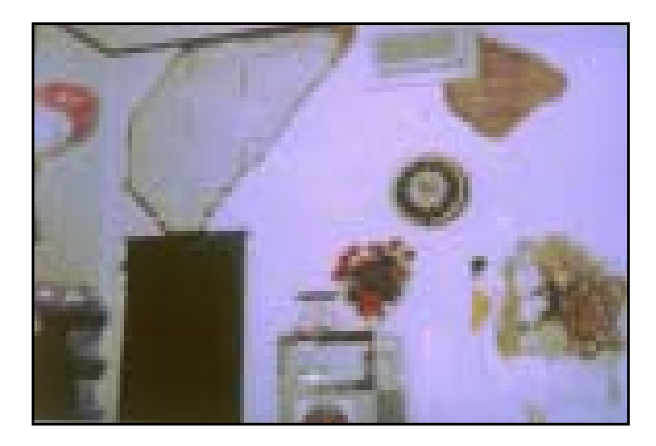
During the rehabilitation, a tenant left an area of the wood lath exposed when repairing the plaster walls in an office space. This treatment was not compatible with the historic character of this traditionally finished space, and the plaster had to be repaired before the project could meet the Standards.

Anne Grimmer, Technical Preservation Services, National Park Service