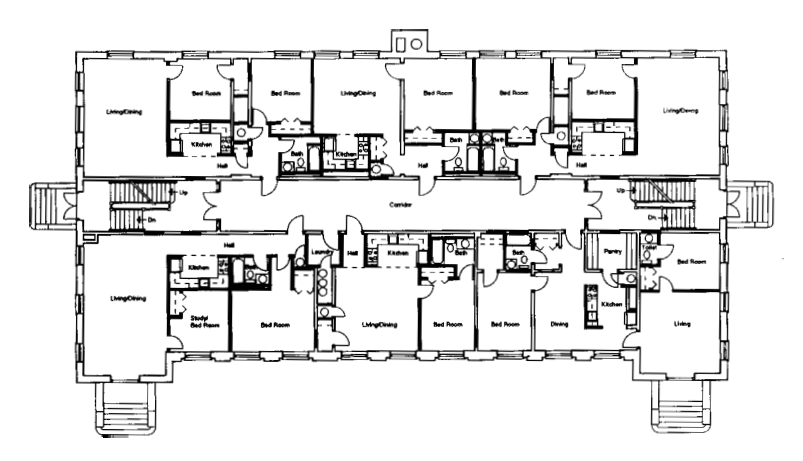
The plan after rehabilitation showing the successful insertion of approximately one unit per classroom.

from the basement to the third story, were separated from the corridor by sets of glazed fire doors with multi-paned transoms and sidelights. Panelled and glass doors with transoms lined the halls, which also retained their wainscotting, baseboard, coat hooks, metal or plaster ceilings, and wood cove molding. The large classrooms retained similar features, and some even contained