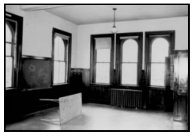
Second floor cloakroom, prior to rehabilitation.

By restricting the number and size of the new units and their associated amenities, the school was easily converted to residential use. The historic character of this building has been preserved by retaining historic features, fabric, and plan.