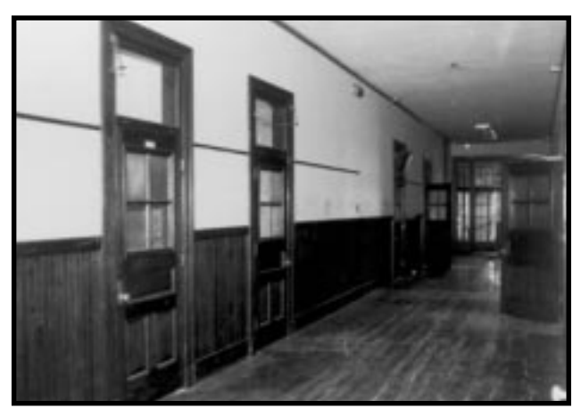
Second floor hallway prior to rehabilitation.