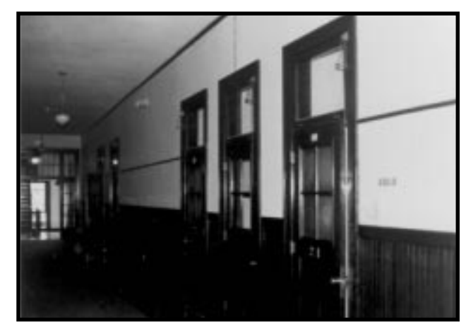
Second floor hallway after rehabilitation. Note retention of historic fabric.

Living rooms, dining rooms, and bedrooms were located against exterior walls and all trim was retained, as well as full-height ceilings (some of which are pressed metal). Kitchens, bathrooms and closets were located on interior walls or within former cloakrooms. Ceilings were dropped only in the utilitarian spaces to allow for mechanical and plumbing equipment. One laundry room per floor was inserted in the original ventilation stack. The existing staircases were retained intact.