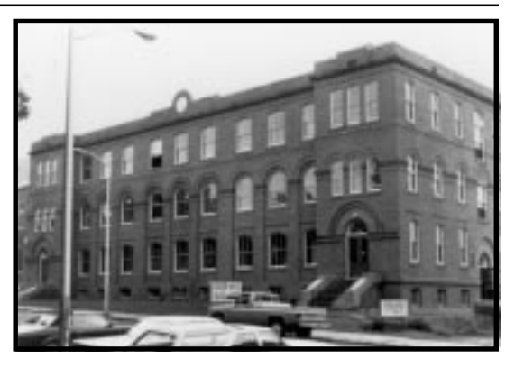
The school after rehabilitation. Windows, doors, and transoms were repaired. The building was not cleaned.

A comparison of before and after photographs documents the sympathetic rehabilitation work. In the hallways, transoms were retained but infilled with fire-rated drywall on the classroom side, the coat hooks were removed, a sprinkler and fire safety system was installed, some doors were fixed in place, and carpeting was installed. Otherwise, the hallways were kept intact. Six apartments were created on each floor - three on each side of the corridors. With few exceptions, the plan was retained by inserting only one unit per classroom.