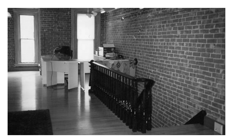
Loss of historic character: The original finished walls and all separations between rooms and hallway have been lost to create an open floor plan, causing this project not to qualify for tax credits.

To learn more about the Standards, visit the National Park Service website at <u>www.nps.gov/history/hps/tps/</u> or contact your State Historic Preservation Office (SHPO)