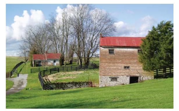
A comprehensive conservation and preservation easement protects the Cambus-Kenneth Farm in Danville, KY.

If certain criteria are met, the owner may be eligible for a Federal income tax deduction for the value of the easement, and Federal estate taxes also may be reduced. In addition, many State tax codes provide state tax benefits for conservation easement contributions where a reduction in the value of a property occurs. There may also be local tax benefits where property tax assessment is based on a property's highest and best use. Since the rules are complex, property owners interested in the potential tax benefits of an easement