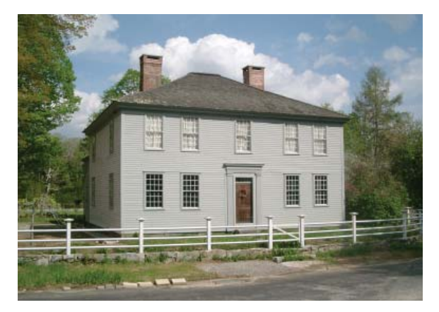
The 1787 Phelps Inn located in North Colebrook, CT is one of several buildings on a 33-acre property protected by a preservation and conservation agreement granted to Historic New England by the late John A. and Nancy Phelps Blum.

Easement valuations have come under closer scrutiny by Congress and the IRS in recent years, and the Federal tax code imposes new qualification standards for both appraisals and appraisers. For example, the appraisal must be prepared in accordance with generally accepted appraisal standards.