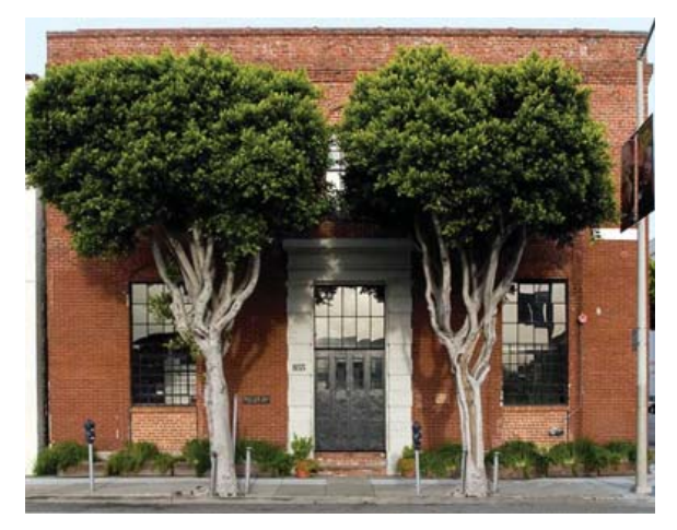
One of a number of historic commercial properties in a historic district renovated by the Ron Kaufman Co., the 1855 Gibb-Sanborn Warehouse, a rare city survivor of the Gold Rush era, is protected by an easement held by San Francisco Architectural Heritage.

In addition to the above requirements, the donor of a preservation easement on a building in a registered historic district must include with his or her tax return photographs of the entire exterior of the building and a description of all restrictions on the development of the building.