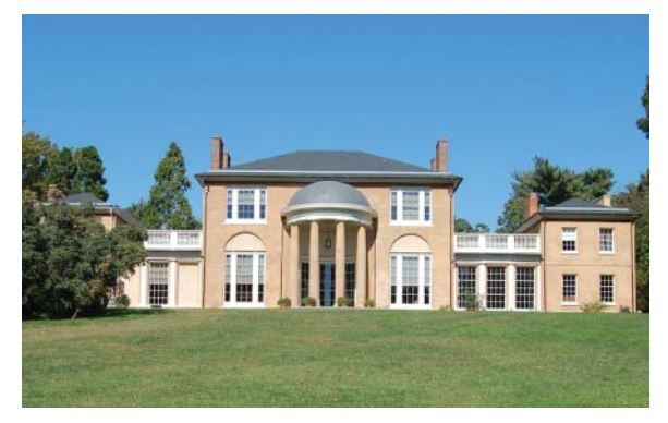
Completed in 1816, Tudor Place in Georgetown, DC, a National Historic Landmark, is protected by an easement covering the building and grounds granted to the U.S. Department of Interior by a direct family descendant of the original owner, the late Armistead Peter 3rd.

historic significance of that district. A registered historic district includes any district listed in the National Register of Historic Places. A State or local historic district may also qualify as a registered historic district, provided the district and the enabling statute are certified by the National Park Service.