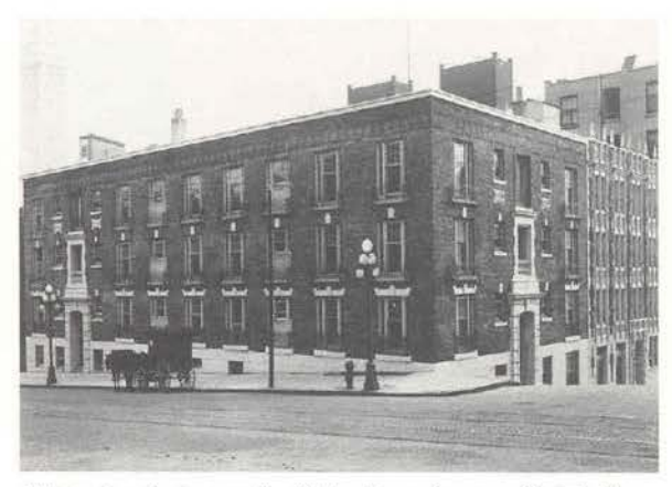
Historic photograph of the Leamington Hotel & Apartments.

the property to prospective office developers, the homeless organized a protest, signaling the need for low-income housing in the area. The homeless advocacy organization then asked Plymouth Housing Group (PHG), a Seattle based non-profit housing developer, to purchase the building and rehabilitate it as low-income housing. PHG began investigating the feasibility of the project in late 1992, and ultimately acquired the property in December 1993 for $2,100,000. After the purchase PHG leased parts of the building to the homeless advocacy organization for use as a night-time shelter until the building was ready to rehabilitate.