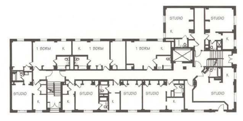
EAST WING, AFTER

The Pacific Hotel rehabilitation successfully utilized the historic floor plan with only minimal changes, as is shown in these before and after plans of the development's east wing