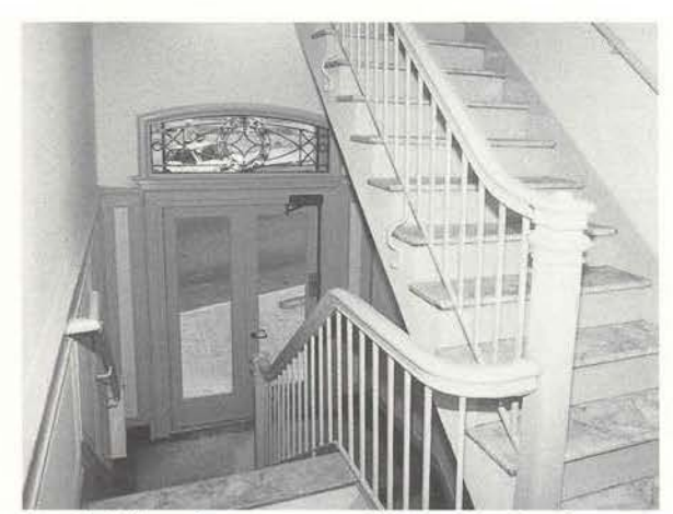
A rehabilitated stairway in the Pacific Hotel.

only feasible option was to create a new, level entry at a point where the sidewalk most closely aligned with the floor. To accomplish this, a large window opening was carefully modified to become a doorway by cutting away the sill. Two apartments were then minimally re-configured and a ramp (leading to an elevator) was inserted between them. As a result, eight units and all common areas were made fully accessible. Another code issue was caused by the balconets (i.e. pseudo-balconies) which blocked emergency egress from 36 bedroom windows. The balconets are integral to the historic integrity of the building's facade. The solution in this case was to cut the guardrail from the frame and remount it as a hinged "gate" with a latch reachable from inside the unit.