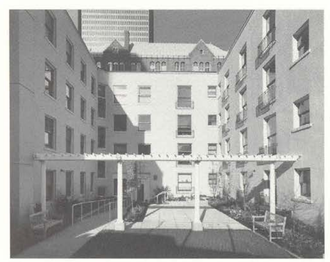
The rehabilitated courtyard, fully accessible from the lobby.