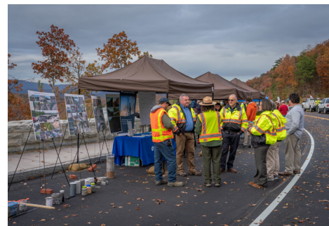
Road safety and engineering education booth at the opening of the Foothills Parkway in Great Smoky Mountains National Park.

Following multiple fatal and serious injury bicycle crashes on the Natchez Trace Parkway, the park conducted an RSA with technical experts and engaged with local stakeholders to identify potential safety solutions. Based on these recommendations, modifications were made to the pavement markings and signage throughout the park in addition to other 4-E efforts. The park did not report any additional fatal bike crashes between 2018 and 2020.