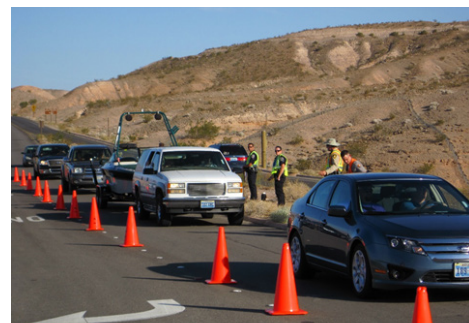
Interagency DUI Checkpoint in Lake Mead National Recreation Area.