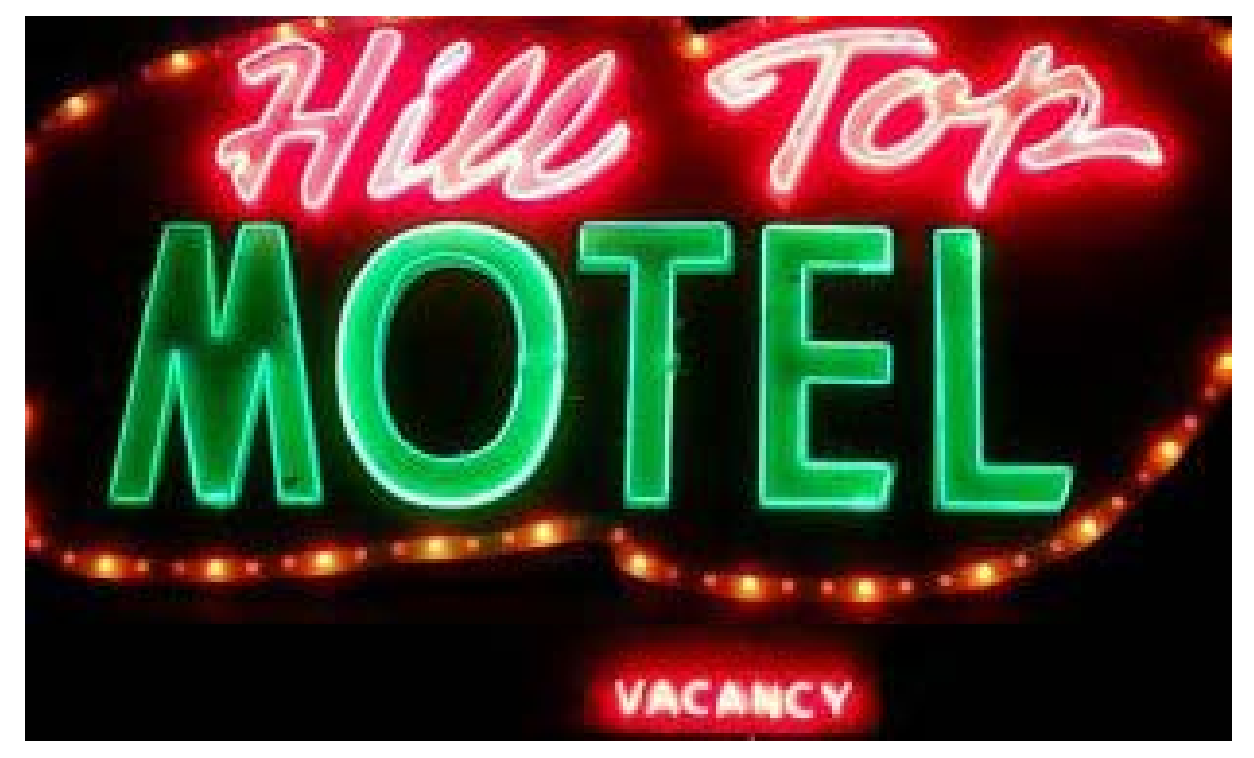
The neon lights of the Hilltop Motel in Kingman, AZ.