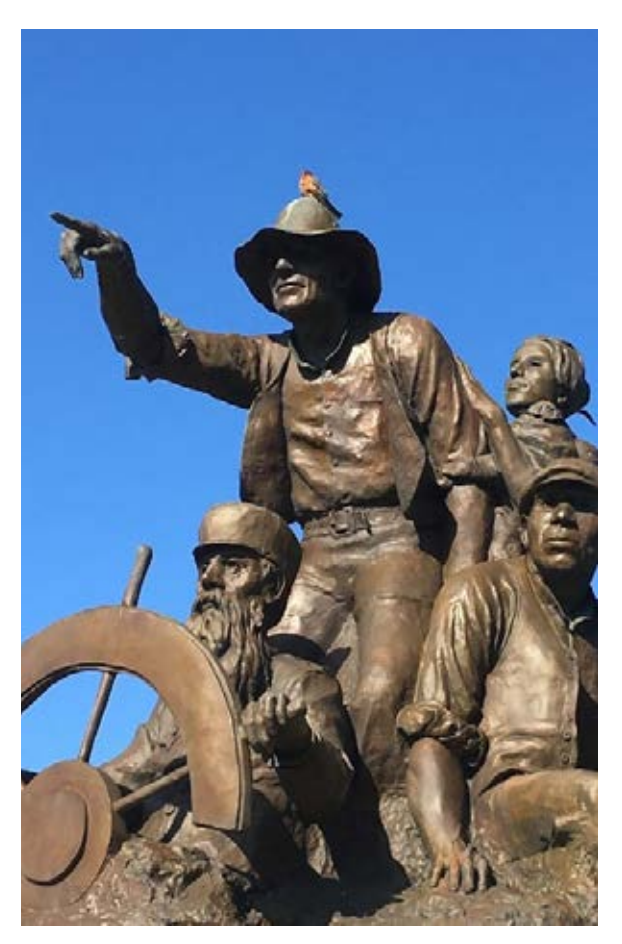
"Journey West" sculpture, St. Joseph, MO