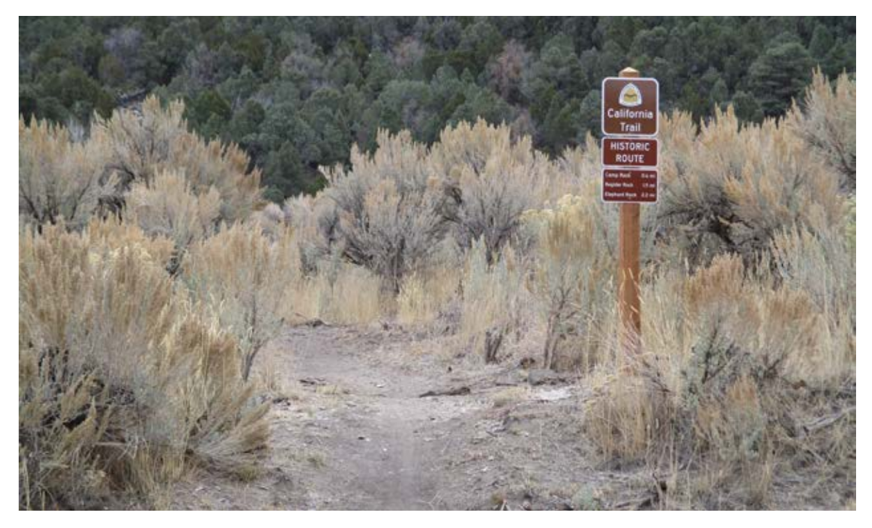
Pedestrian signage at City of Rocks installed in 2020, located along CALI in southern ID.