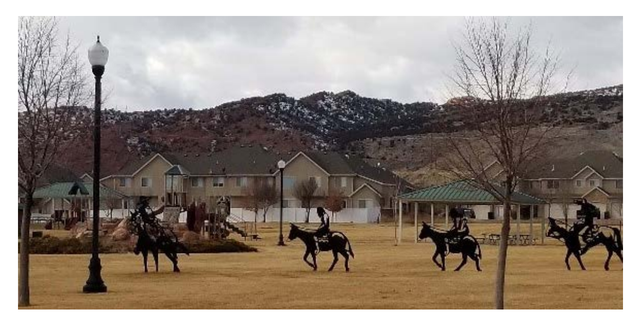
OLSP silhouettes, Richfield, UT