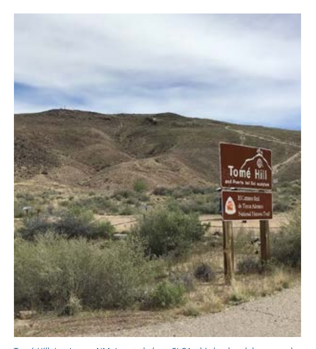
Tomé Hill, Las Lunas, NM. Located along ELCA, this landmark has served travelers for centuries.

southern end of ELCA. Work commenced on acquiring oral histories and published and nonpublished documentation of the American Indian and native Mexican association with the trail.