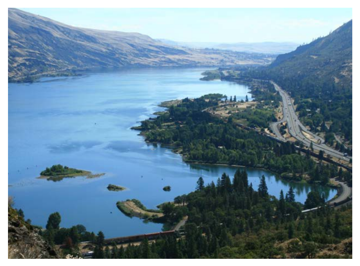
The Columbia River as seen from Rowena Crest Viewpoint (Mosier, OR)