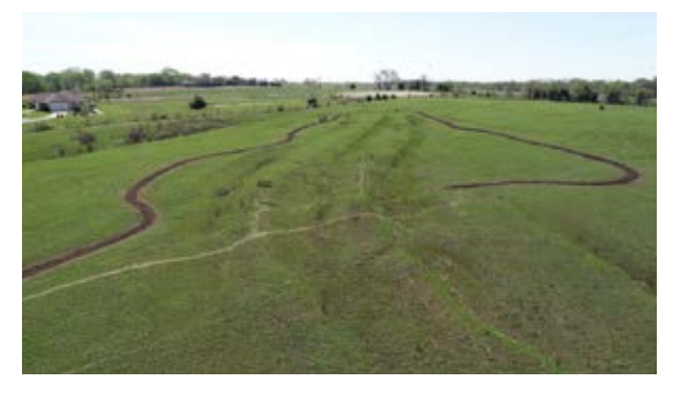
Aerial view of the ruts and newly constructed trail at Ivan Boyd Prairie, located along SAFE in Douglas County, KS