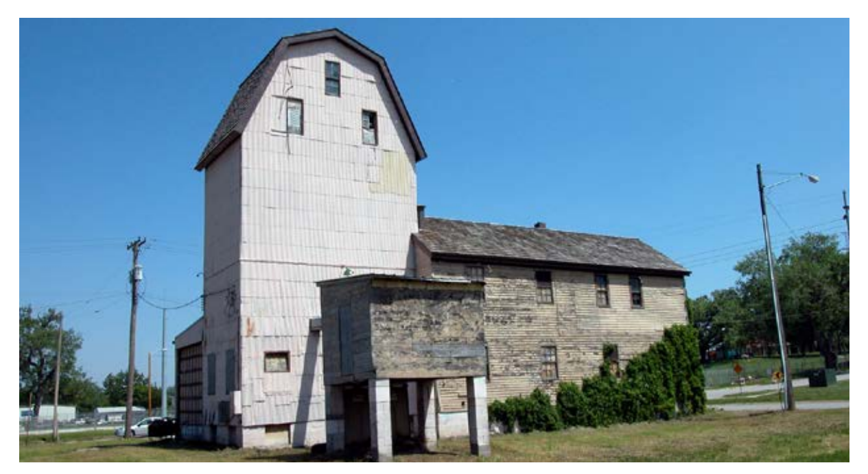
The historic Florence Mill, built in 1846 near Omaha, NE.