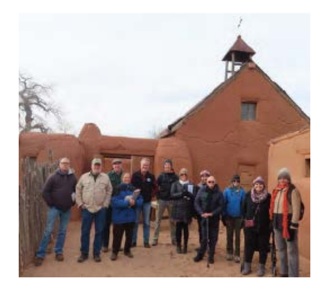
Staff, partners, and contractors on a site visit for the ELCA interpretive plan at El Rancho de las Golondrinas, Santa Fe, NM.