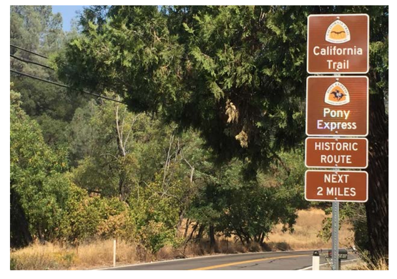
Newly installed highway signs along CALI and POEX as part of the CalTrans signing project.

NTIR's GIS specialists presented to the National Trails System GIS Network concerning the Pony Express Re-Ride App including coordinating with our NPEA partner and updates to the web mapping application for future re-rides.