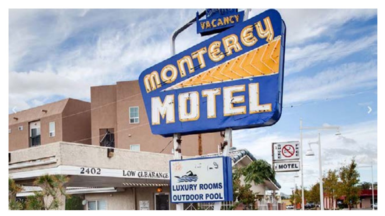
The historic Monterey Motel in Albuquerque, NM.

Provided support to the national nonprofit organization, the Route 66 Road Ahead Partnership, via a cooperative agreement. This included ongoing work with Rutgers University to continue research of the economic impacts of historic preservation, organizational sustainability initiatives, facilitating a partnership with Research Route 66, and participation in board, executive committee, and Working Group meetings.