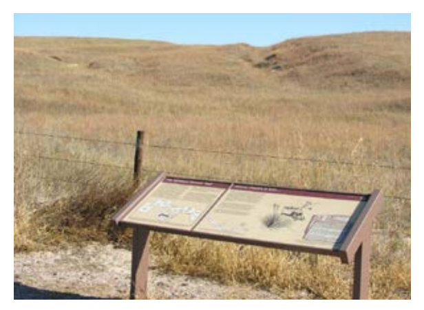
Interpretive signage at the Sand Hill Ruts, near Sutherland, NE, along MOPI.

KEY PARTNERS/COOPERATORS: IMTA, MTSU CHP, and LDS.