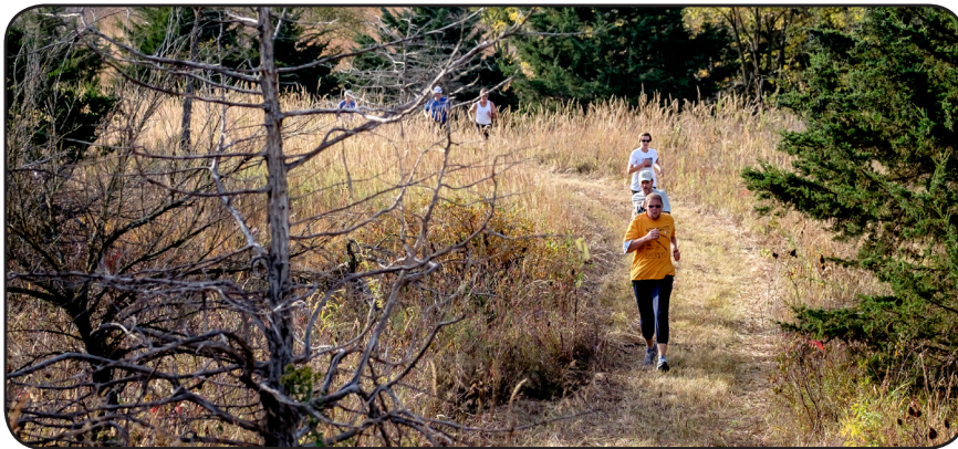
Oregon Trail Trek fun run at Alcove Spring Park