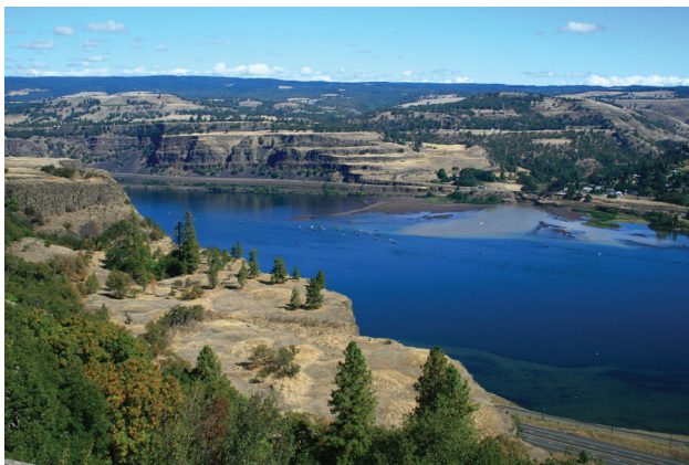
Columbia River Gorge, Oregon from Rowena Crest

Progress on the auto tour route guide for the Oregon NHT is on track. Driving directions for the primary route of the Oregon Trail, the Barlow Road around Mt. Hood, and the Applegate Trail are drafted and in review. Thanks go to the OCTA Northwest Chapter mapping teams for testing the driving directions along parts of the route. The next step is for the National Park Service to seek landowner permission to include privately owned property, and to give owners and managers opportunity to review the entries about their sites.