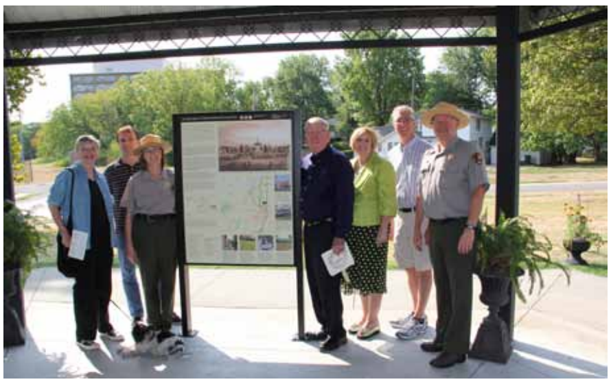
Partners and NTIR staff attended a dedication on August 11, 2012 for five new waysides installed at McCoy Park in Independence, Missouri.