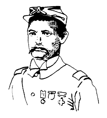
Lt. Joseph P. O'Neil

The fame of being the first Euro-Americans to cross the Olympics went to the 1889-90 Press Party. Financed by the Seattle Press , the well-publicized expedition crossed via the Elwha and Quinault Valleys, a six-month ordeal during one of the worst winters in history. A month after the Press Party emerged from the mountains, Lt. O'Neil began his second expedition. He and his men explored the eastern and southern Olympics between Hood Canal and the Pacific. The area inspired him to advocate establishment of a national park.