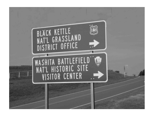
New Highway 47 signs