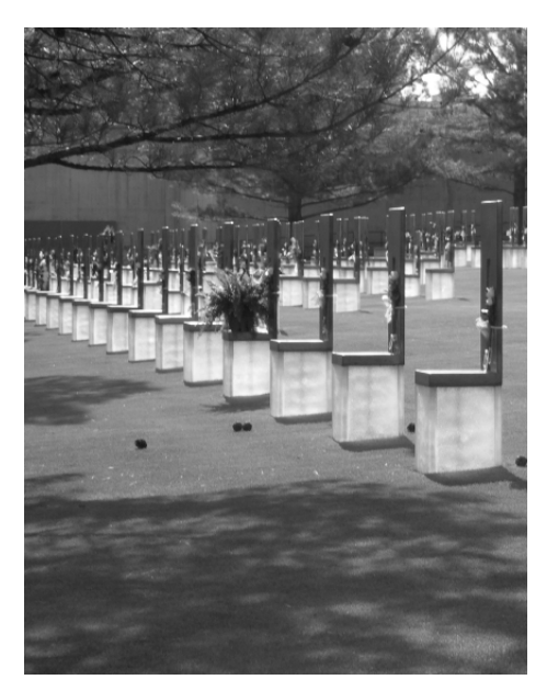
Chairs with flowers