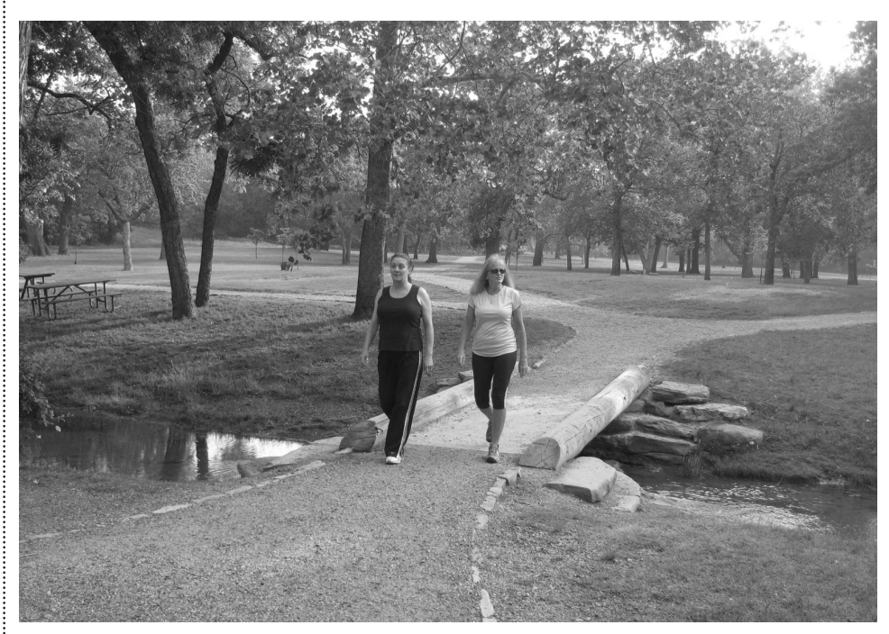
Platt Trail Blazers walking the Flower Park trail

For more stories and information about Washita Battlefield National Historic Site, please turn to pages 6-7.