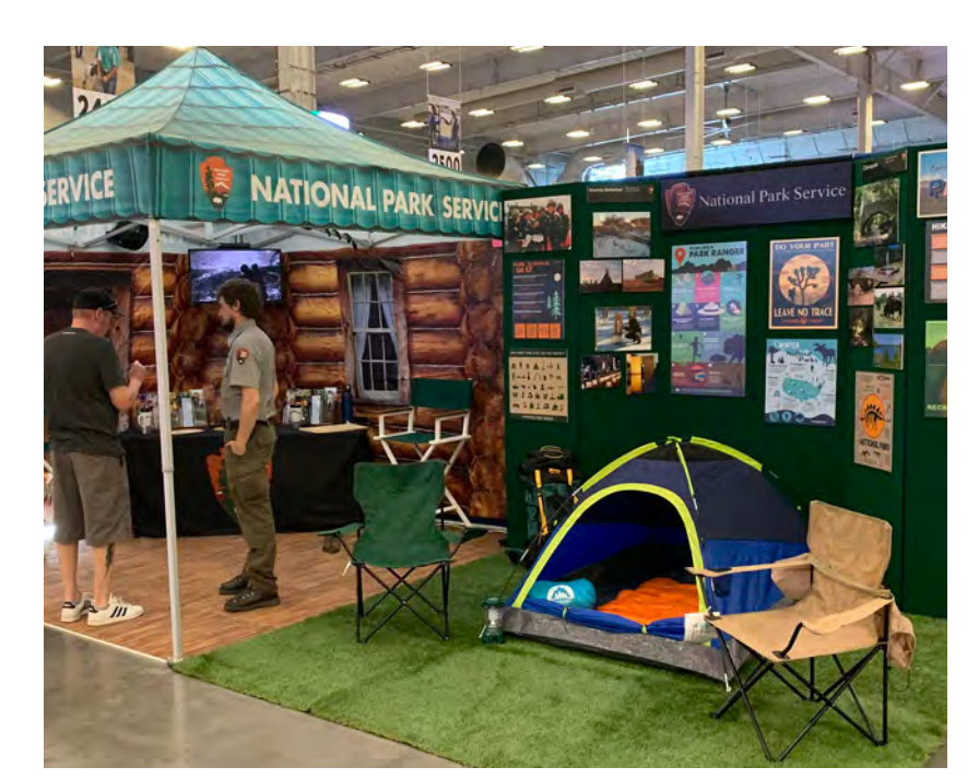
A park ranger talking with a visitor at the state fair