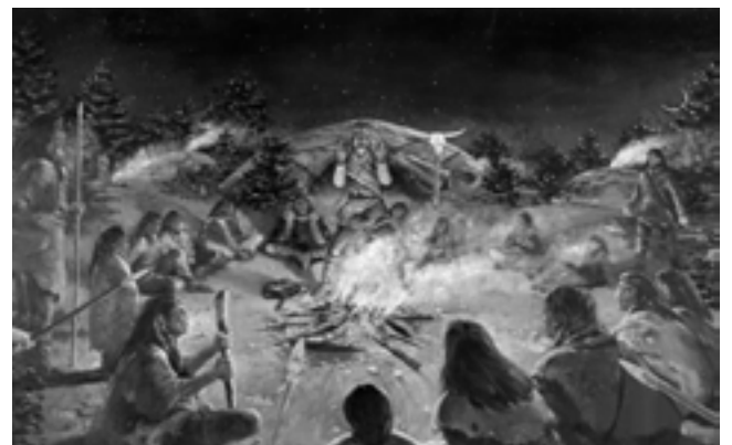
(PALEO INDIAN CAMPFIRE)