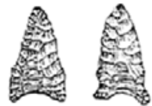
(FLUTED DALTON POINTS)

Chert deposits may have attracted Paleo Indian groups of this subperiod to