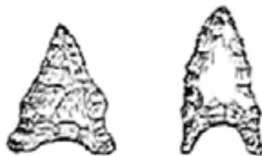
(UNFLUTED DALTON POINTS)

specific locales in order to replenish their stone tools. Such a tendency may have constrained these groups to a specific landscape, setting the stage for the intensive regional specialization that characterized the succeeding Archaic Period. It is possible that large Paleo Indian sites in the southeast are permanent or semi-permanent base camps from which resources of specific territories were exploited. Trade or transportation of stone tools appears to decrease as Late Paleo Indian groups relied on local materials for their needs.