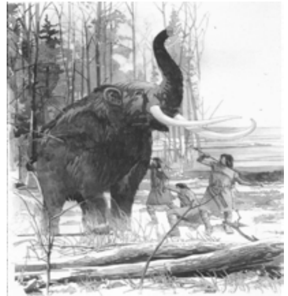
(HUNTING IN THE PALEO INDIAN PERIOD)

The current view of the Paleo Indian period envisions bands of hunters entering the North American continent around 17,000 years ago (15,000 BCE) by crossing a land bridge that connected eastern Siberia with Alaska. The land bridge was exposed during the Late Pleistocene by continent-sized glaciers, which, when created, drew water from the oceans, lowering sea levels by some 120 meters. It would appear that these same glaciers prevented these immigrants from expanding across the entire North American continent until about 16,000 years ago (14,000 BCE).