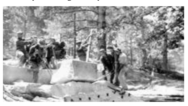
(CCC MEN AT A QUARRY)

entrance, a building resembling the design of old nineteenth century Fort Hawkins was added for the CCC visitor guides. Work continued on a large protective shelter over the Funeral Mound. In 1941 some of the CCC enrollees' duties transferred to nearby Camp Wheeler an infantry training facility.