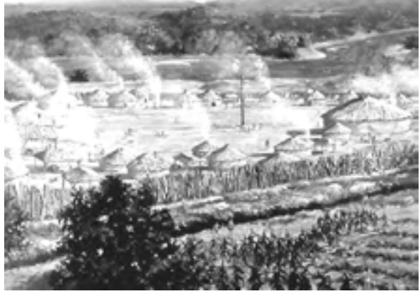
(VIEW OF A MUSCOGEE CREEK VILLAGE)

its own lot on which as many as four houses stood, according to the size and wealth of the family.