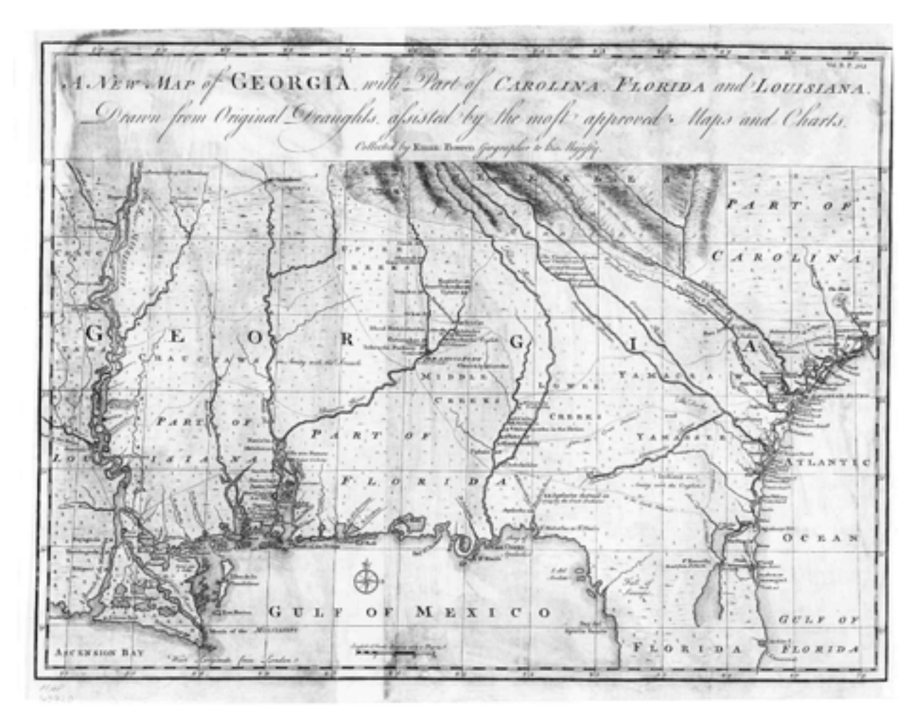
(MUSCOGEE CREEK COUNTRY AROUND 1745)

1675. This brought varied manufactured goods to the Creeks and introduced them to capitalism. Their desire for these trade goods created industries in deerskin trade and Indian slave trade for the Caribbean sugar plantations. The ancient Creek way of life was changed forever.